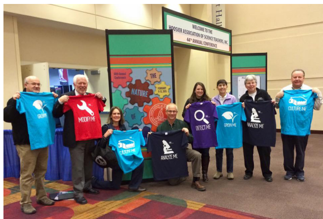
Free tee shirts from 2015 HASTI Conference

If you have been a member of HASTI for a few years, I am guessing you have some great artifacts! If you might be cleaning and organizing, and come across any items you would like to donate, I would be more than happy to make arrangements to collect them, or pay for you to send them to me.