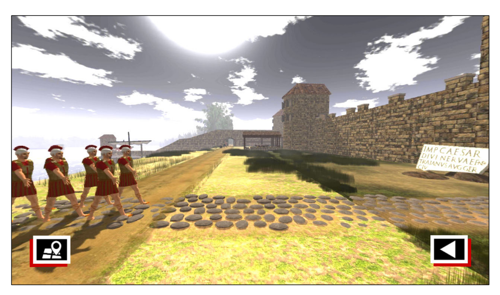
Figure 4. A static parade of Roman soldiers. Noticeable is the use of two different textures within this one reconstruction. Also, because of poor rendering, some of the stones of the road appear to float.