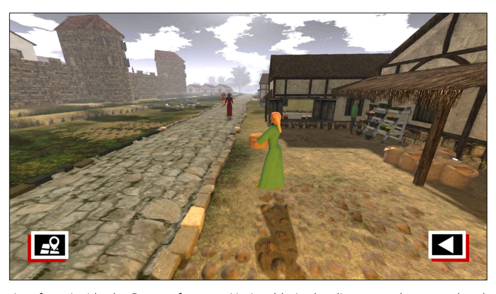
Figure 3. A view from inside the Roman fortress. Noticeable is the disconnect between the shade and the woman.