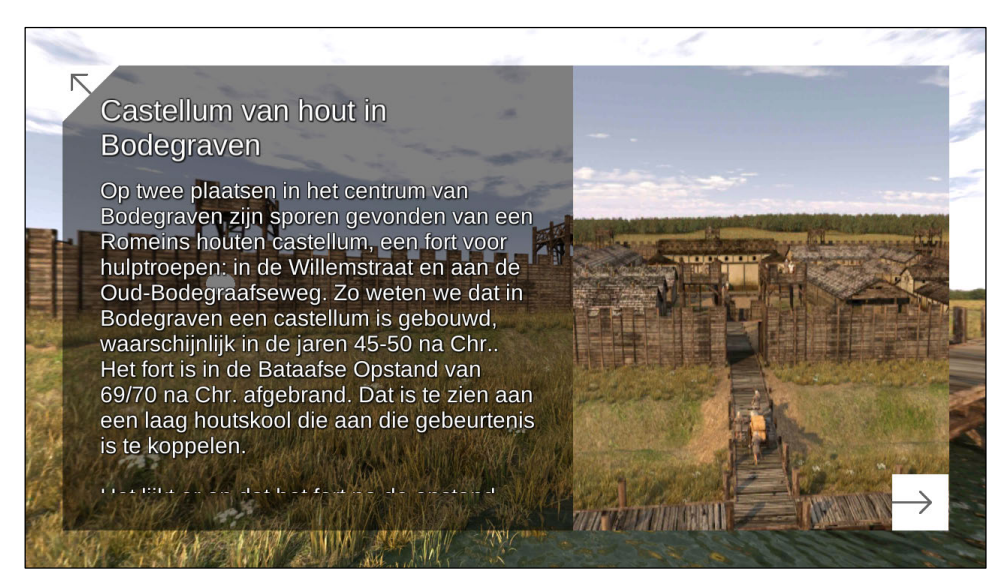
Figure 2. An example of an information screen from the Bodegraven standalone app.

A user can choose to obtain information and descriptions of points of interest by means of text or audio. Sometimes videos are also incorporated. If desired, the user can get a short or a long version of the text or the audio. This is mostly GPS-based. Information on the interest points is also accessible when the user is not on location, but it can be a bit fiddly to find it all. The routes themselves are advertised on the municipal website and on the website of the foundation.