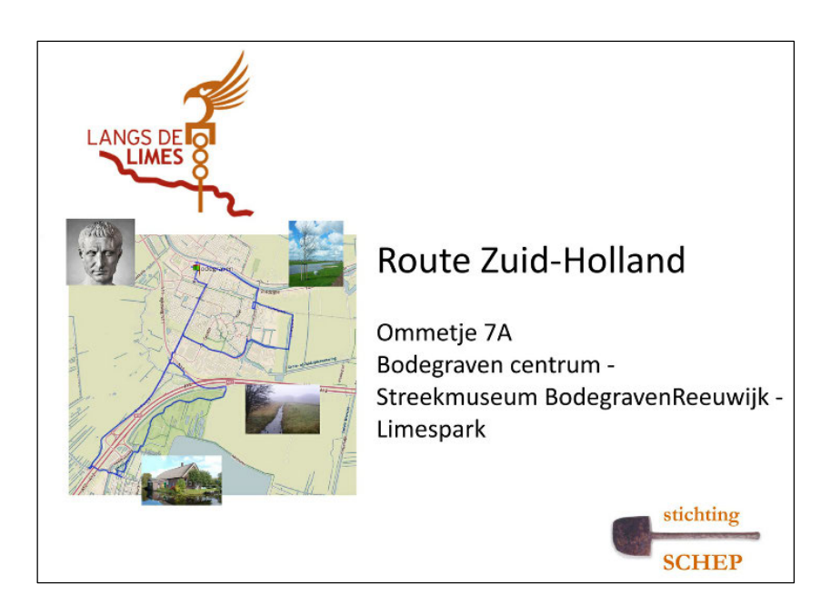
Figure 5. The figure shows one of the routes through Roman Bodegraven.