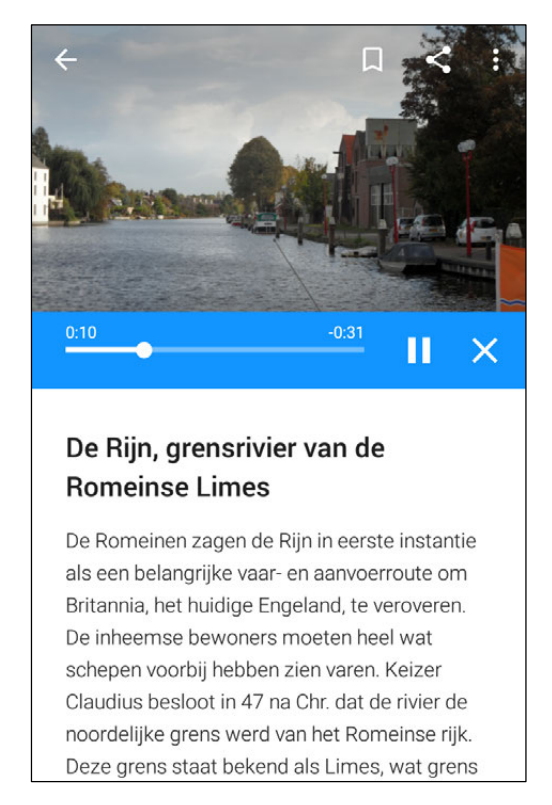
Fig 6. The Route app in action. The text onscreen is also available as a sound file that can be listened to at the same time.

The routes are content packages that are part of a larger app-platform. For a user, this means that he/she first has to find or obtain information on where the app is to be found, and after that, he/she must find the content packages, e.g. the route. These steps require informing the public and perhaps even providing a little bit of guidance. For this app, the first version of the platform was quite cumbersome, which hindered the use of it and finding the routes. Installing the routes was a chore and not very user-friendly. Again, updates have massively improved this process. It should also be mentioned that at the launch, even the municipal website originally simply provided a link to the routes without mentioning the app which was needed. Later this was amended.