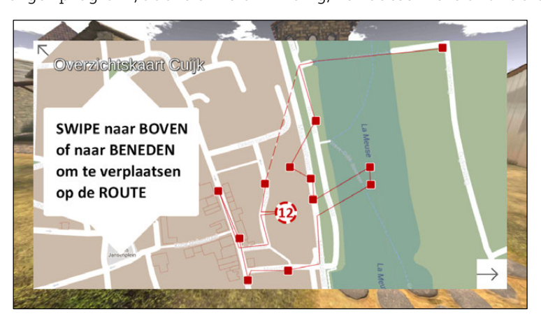
Figure 1. A screenshot of the viewpoints and routing from the Cuijk standalone app with an incomplete and non-functional explanation for navigation within the app. Translated, it says "swipe up or down to move along on the route."

A second example is the Route app. It is a competent and relatively simple app for which routes as content packages can be created. The content packages in this specific case are routes along the Roman border, the limes . These were created by a small foundation, subsidized by regional government, in collaboration with a local municipality that also provided some co-financing. The routes are part of a larger program; at the time of writing, 23 routes were available.