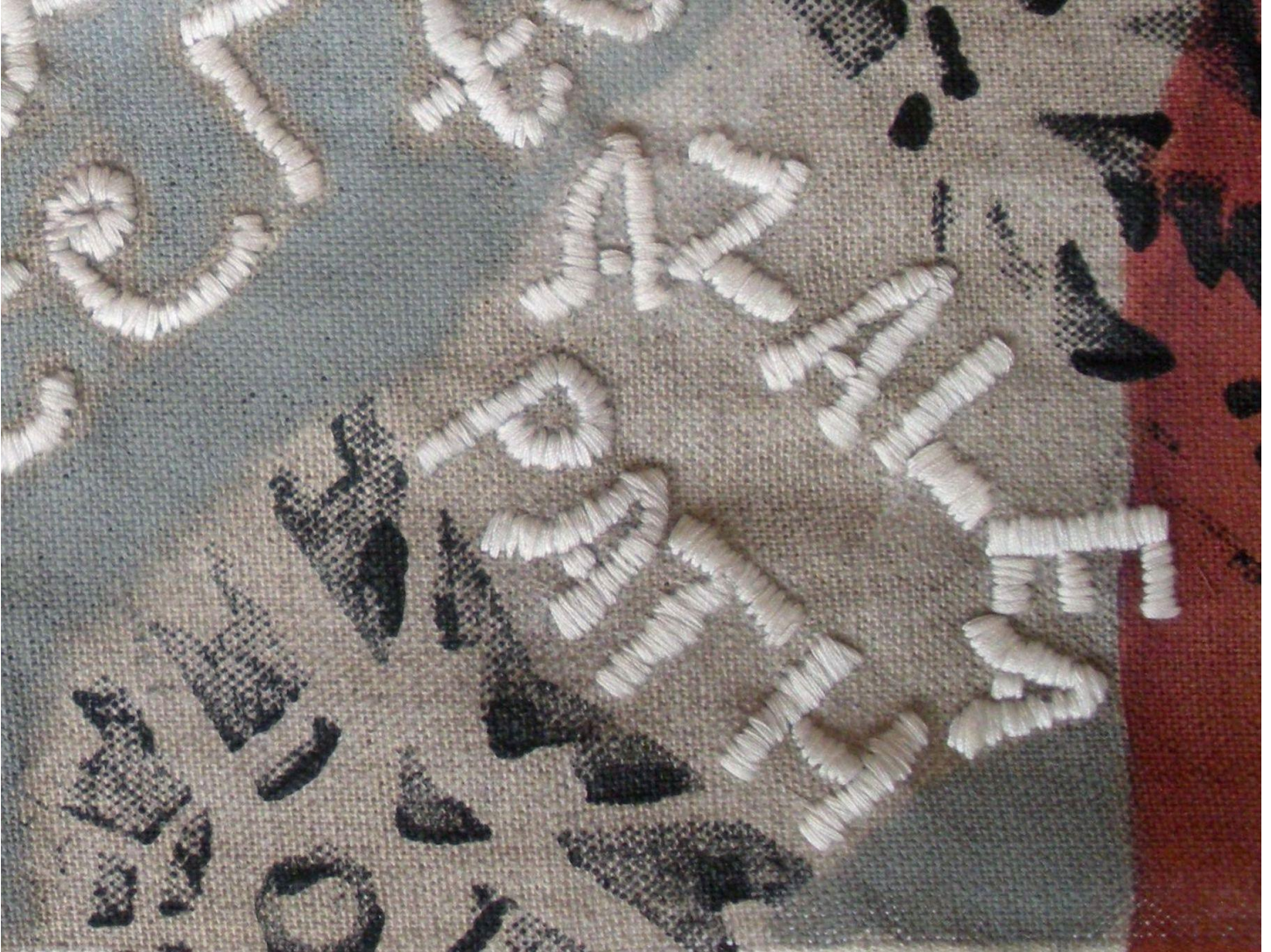
Out of the Shoe and into the Cauldron, detail