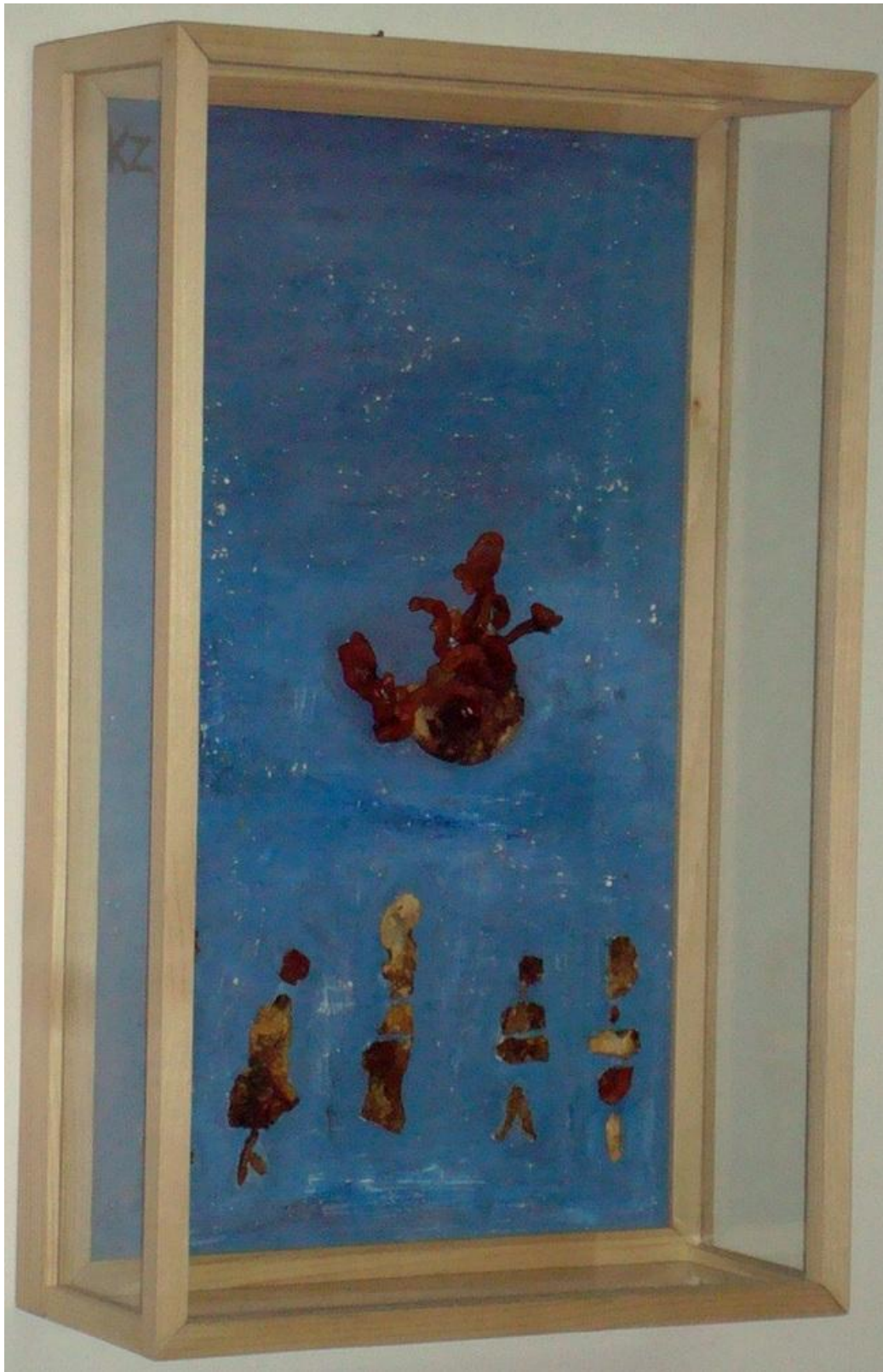
Troublous Wringing of Hands (Ocean), in the glazed frame.

*We recommend viewing the images at 200 %.