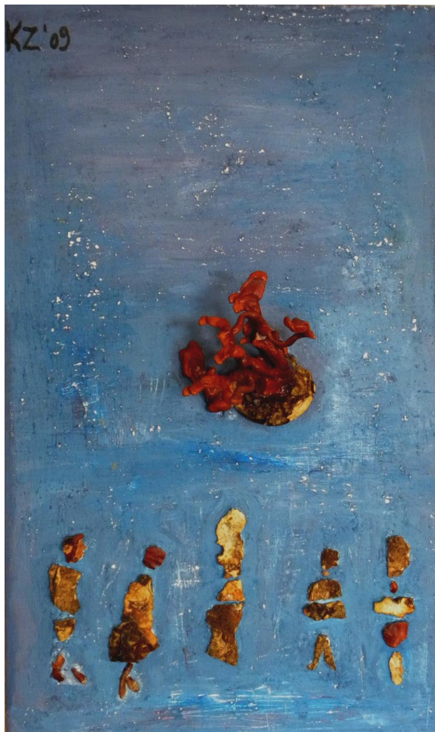
Troublous Wringing of Hands (Ocean) . Mixed media on canvas (acrylic, cultivated fungus, pastel), 62 x 38 cm, 2009. Note: in Chinese culture, the fungus Ganoderma lucidum is a symbol of longevity and immortality.