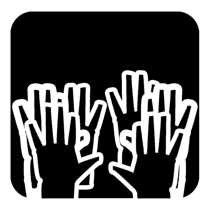
Figure 1. The icon for the TK Outreach License.

By describing and defining the rights and expectations of both the TK holders and users, we hope to highlight the reciprocal nature of any and all uses of these materials. That is, we are aiming to promote a conversation that extends beyond the creation of a license in order to help foster meaningful dialogue and negotiations between various stakeholders who have historically not been in dialogue. Where IP laws and regulations can be very complicated and confusing, we aim for the process of generating the TK Licenses and Labels to be both straightforward and sensible.