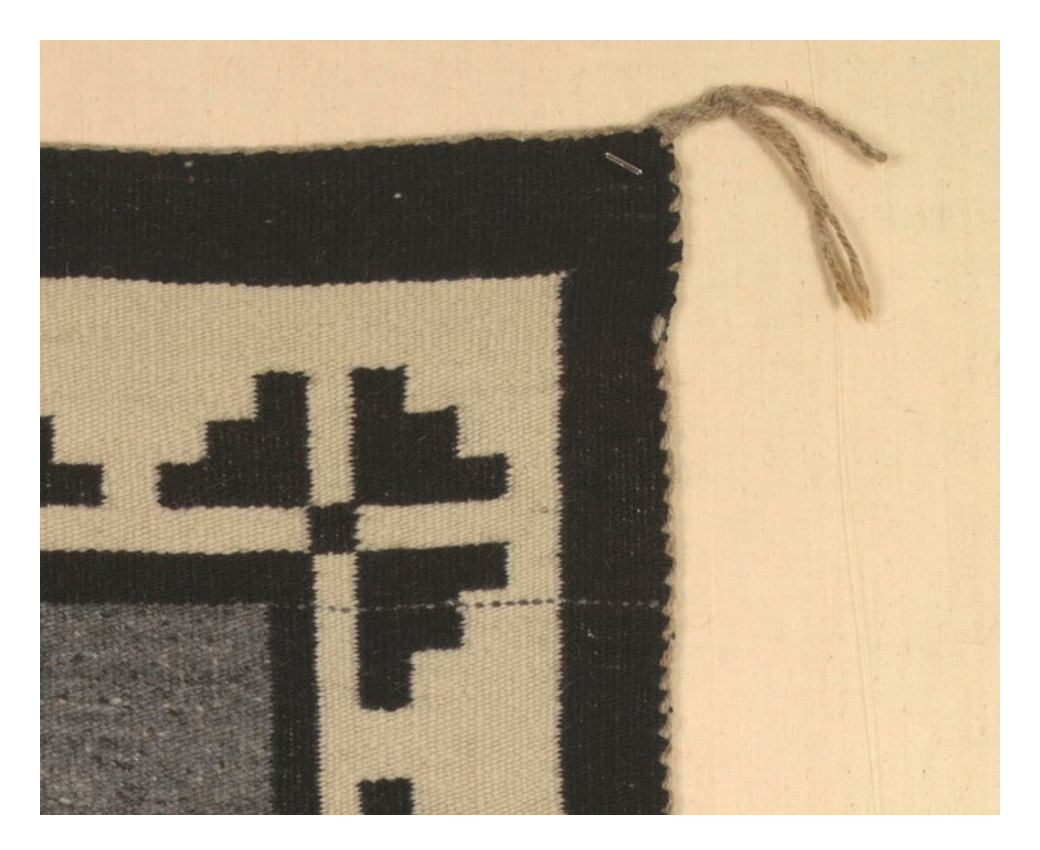
Figure 2. Detail of the textile presented in Figure 1 showing the ch'ihónít'i more closely. It is the horizontal line (appearing here as a dashed black line) running from the inner figure to the textile's boarder. As noted in the caption to Figure 1, this photograph of a textile in the collections of the American Museum of Natural History (Catalog Number 50.2/6854) is presented courtesy of the Division of Anthropology, American Museum of Natural History.