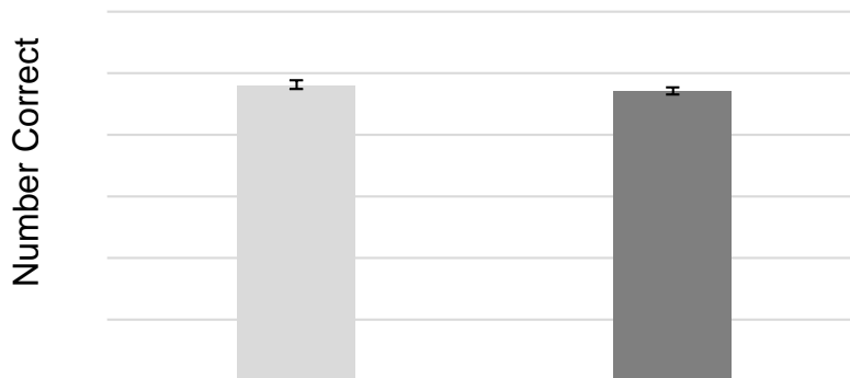
Figure 1: Unit exam scores by condition (means and +/- 1 standard error bars)

To compare the relative effectiveness of the quiz-and-reflection condition versus the extended-quiz condition on performance, the effects of condition on both the sum of the unit exams scores and the final exam score were examined. First, a one-way ANOVA was conducted with condition as the independent variable and the number of items answered correctly on the three unit exams as the dependent variable. There was no difference between conditions, F(1, 217) = 1.07, p = .30 (see Figure 1).