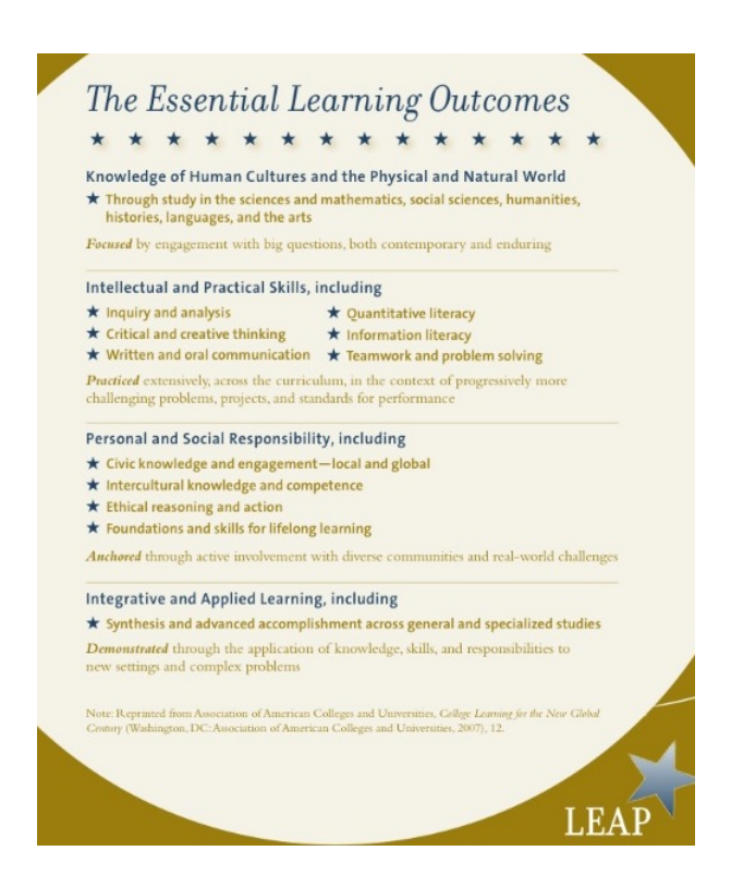
Figure 1. LEAP (2005) Essential Learning Outcomes.

The LEAP National Leadership Council (2007) refers to a "Framework for Excellence," which encompasses the process of integrating ELOs across disciplines through an intentional focus on the part of teachers and students. As part of the LEAP initiative, AAC&U also promotes the importance of "High Impact Practices" to support the students' acquisition of essential learning outcomes. The council emphasizes the importance of offering students opportunities to apply interdisciplinary knowledge and to acquire a perspective for learning that involves creating knowledge through real-world problem-solving activities.