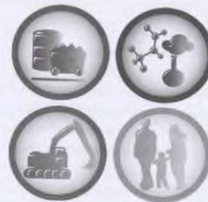
Graphic B, Source: www.naturalstep.ca

concentrations of substances produced by society, (3) degradation by physical means, and in that society (4) people are able to meet their needs. Graphic B presents a visualization of each of the four system conditions.