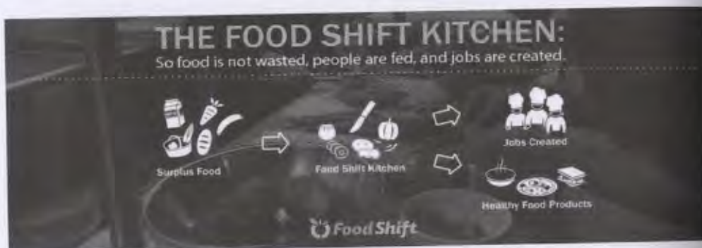
Graphic C, Source: foodshift.net

There are other programs with good ideas that could be used in addition to food rescue. The Sierra Club's website shares many possible programs, starting with Food Shift in California, a twist on food rescue that involves government intervention and service instead of volunteer work. Food Shift works with local businesses to help them improve the tracking of their food waste and then works with the local governments to create interventions in the parts of the process with the most food waste. Founder Dana Frasz wants to think about "food recovery as a government service that provides jobs, rather than as a charity thing" (Sierra Club). This cuts the high amount of volunteers needed for food rescue and provides jobs in the community. With government involved, businesses may be more inclined to improve the tracking of their food waste and cut down on it. However, some citizens, farmers, or business owners here may not be up to the idea of government intervention in the food process. Graphic C, from Food Shift's website shows their main goals in a simplified form.