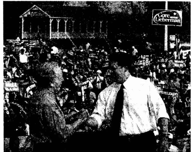
Figure 4: "Democratic presidential candidate Vice President Al Gore and his running mate, Sen. Joseph Lieberman of Connecticut, exchange a handshake Wednesday after a campaign rally in Jackson, Tenn." (Source: South Bend Tribune , October 26, 2000, page A3)