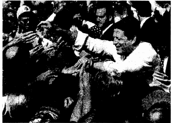
Figure 2: "Vice President Al Gore, the Democratic presidential nominee, greets supporters Wednesday in Warren, Ohio, the morning after his debate with GOP nominee George W. Bush." (Source: South Bend Tribune , October 5, 2000, page A1)