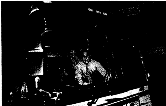
Figure 3: "Republican presidential candidate George W. Bush and his brother, Florida Gov. Jeb Bush, look out from their bus as they arrive inside an auditorium for a rally at the Florida State Fairgrounds in Brandon, Fla., Wednesday."