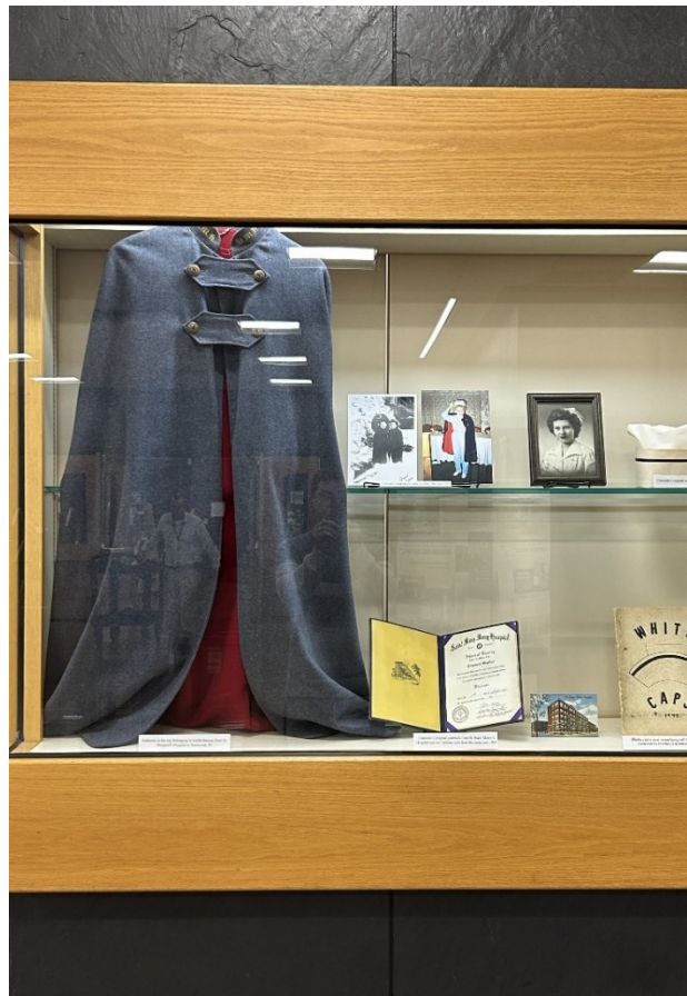
Right wall display case.