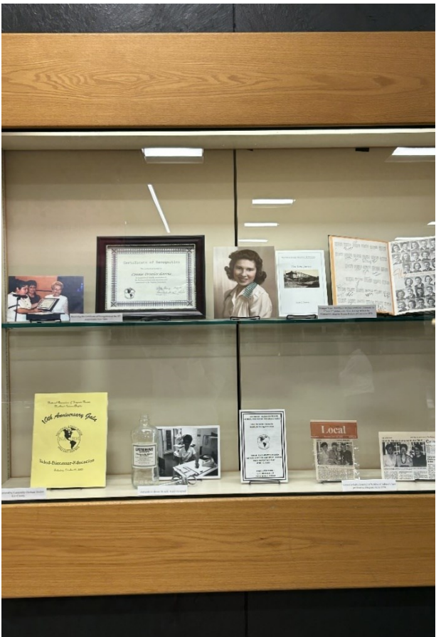
Left wall display case.