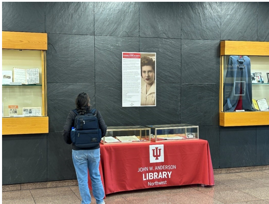
Student viewing the exhibit in the Anderson Library lobby.

This article is distributed under the terms of the Creative Commons Attribution 4.0 International license ( https://creativecommons.org/licenses/by/4.0/ ).