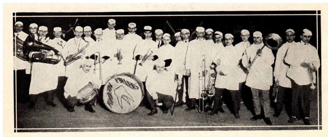
Indiana Dental College Student Band, the "Tooth Pullers," 1921.

The most interesting discovery from the archives was the surprising fact that every basketball game was accompanied by a twenty-two piece, all-student band, the much more imaginatively named "Tooth Pullers." One can only hope that they dressed as they did in the picture for every performance. Does a band dressed like dentists (or dentists acting like a band) give a certain psychological advantage to a team? To put things into perspective, the total student body at IDC in 1915 was around 200 (dental school was three years at that time). There were thirteen on the basketball team and twenty-two in the band, so, about seventeen percent of the students were directly involved despite being in a grueling academic program. That's some pretty impressive school spirit . . . or perhaps just a desperate need for fun.