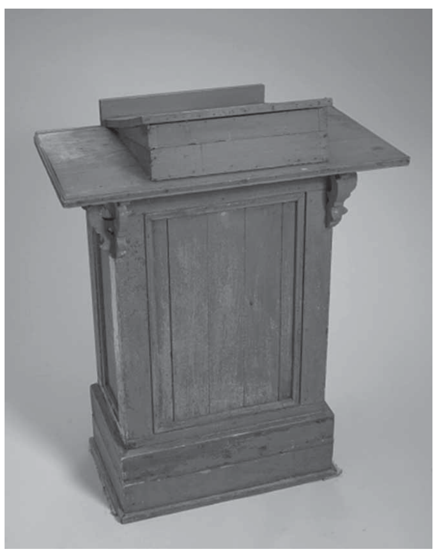
Podium used at the Wayman Chapel A.M.E. Church in Lyles Station, Indiana. The museum's "Power of Place" exhibit presents ten "place studies" offering "intimate views into distinct moments of the African American experience." One of those place studies features the historic African American community of Lyles Station, Indiana. Collection of the Smithsonian National Museum of African American History and Culture, gift of the Lyles Station Historic Preservation Corporation