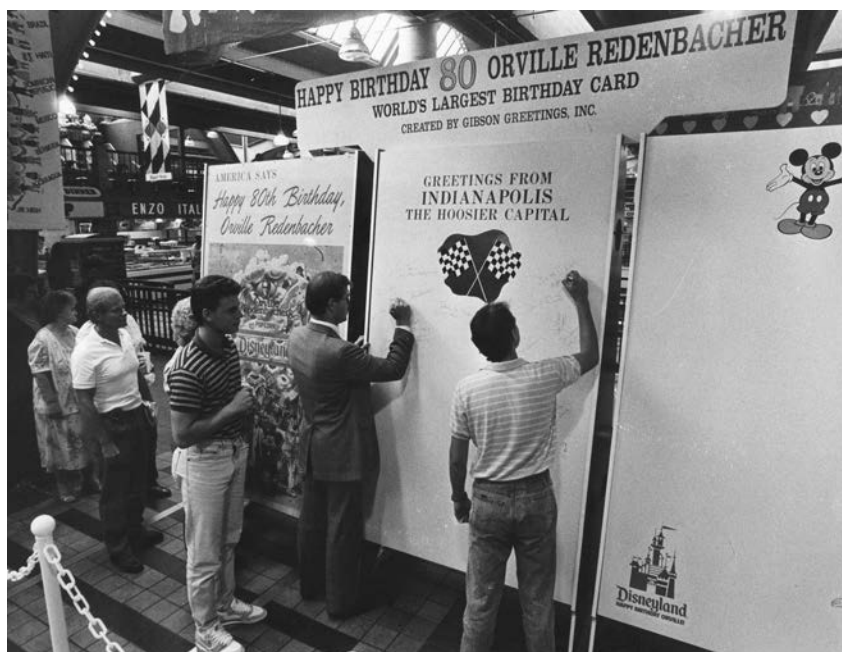
Fans in Indianapolis signing one section of a giant card for Redenbacher's 80th birthday.

In 1987, an extensive public relations campaign involved an Amtrak train that stopped at fourteen cities across the country, carrying an 1800-square-foot "birthday card" eventually signed by about 100,000 people.