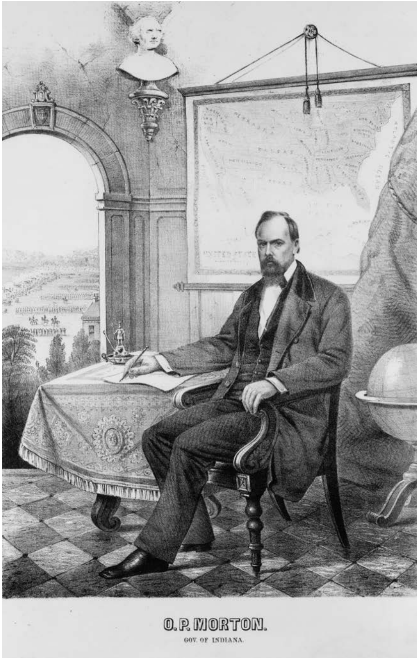
Morton as Civil War-era governor, with a military parade shown in the background of this c. 1862 print. After his death, Morton was often remembered as the Soldiers' Friend and as a staunch defender of the Union.