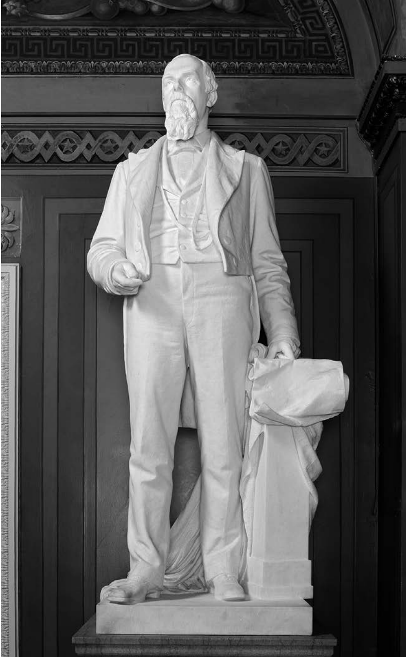
Marble statue of Morton by Charles H. Niehaus, 1900. The state of Indiana chose to memorialize Morton in the Statuary Hall of the U.S. Congress.

Architect of the Capitol website, http://www.aoc.gov