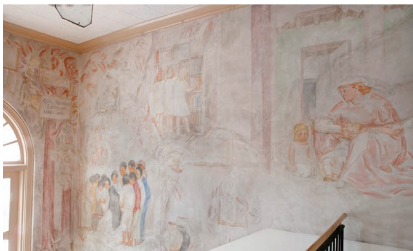
Santa Fe Public Library mural, 1934. The building now houses the New Mexico History Museum's Fray Angélico Chávez History Library.