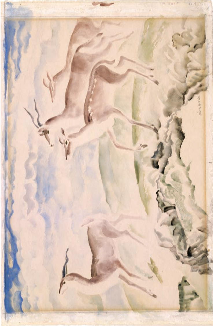
Clouds and Gazelles , c. 1939. Rush was known not only as a muralist and illustrator but also as a master watercolorist. Indianapolis Museum of Art, Mary B. Mikikien Fund, 39.73