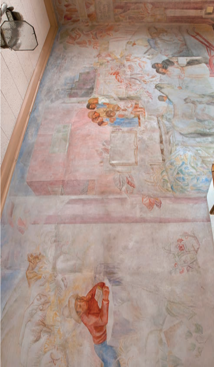
Santa Fe Public Library mural, 1934. Based on her sketches of local children, the murals depict people in their everyday lives absorbed in reading.