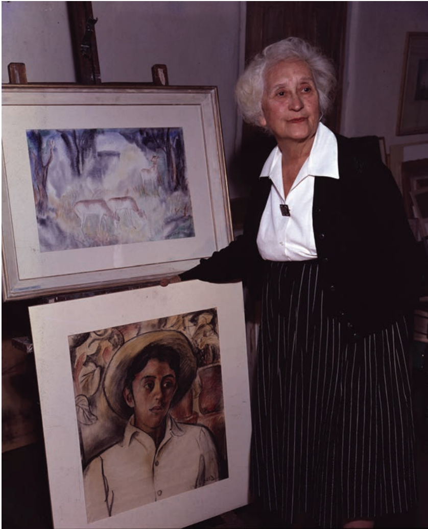
Olive Rush, 1956.

New Mexico Department of Tourism Photographic Collection, Image #066039. Courtesy of the New Mexico State Records Center and Archives