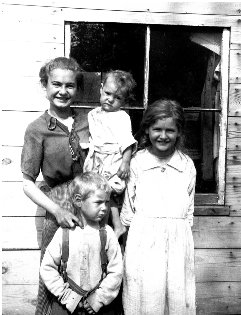
Steuben County, ca. 1918. Dressed in their Sunday best, members of one family smile for the camera as the field worker evaluates their well-being.