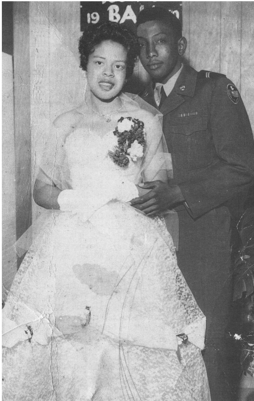
COUPLE AT GARY ROOSEVELT HIGH SCHOOL MILITARY BALL, C. 1959