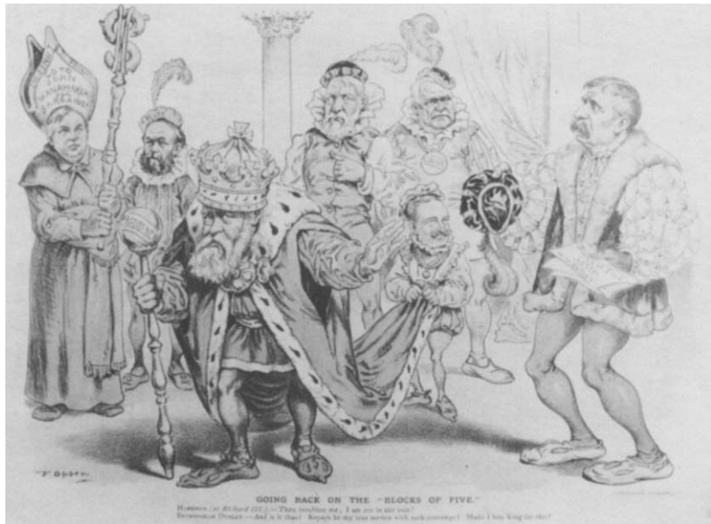
Reproduced from Puck , XXV (May 15, 1889), 208.