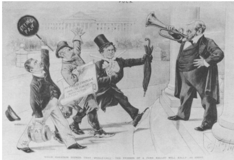
Reproduced from Puck , XXIV (January 16, 1889), 346-47.