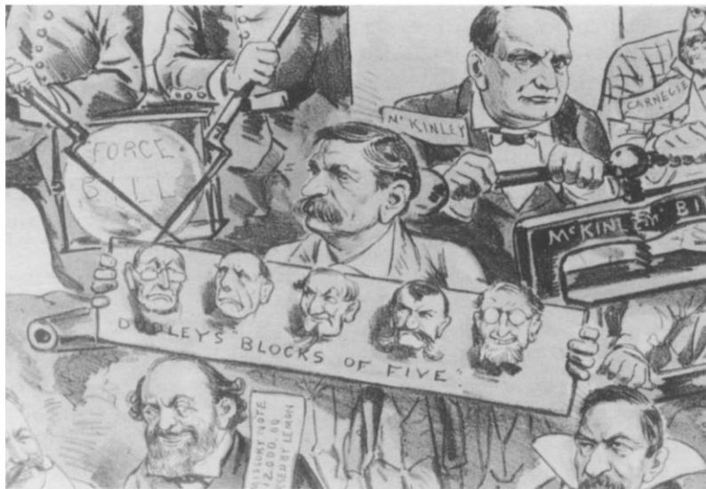
Reproduced from Puck , XXVIII (September 17, 1890), 56-57.