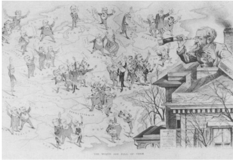
Reproduced from Puck , XXIV (January 9, 1889), 330-31.