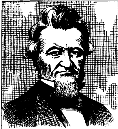
COL. GEORGE WASHINGTON EWING.