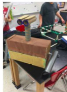
Counseling robot accompanies students who need to leave class