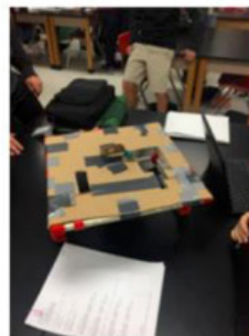
Safety robot with varied alerts for emergency procedures