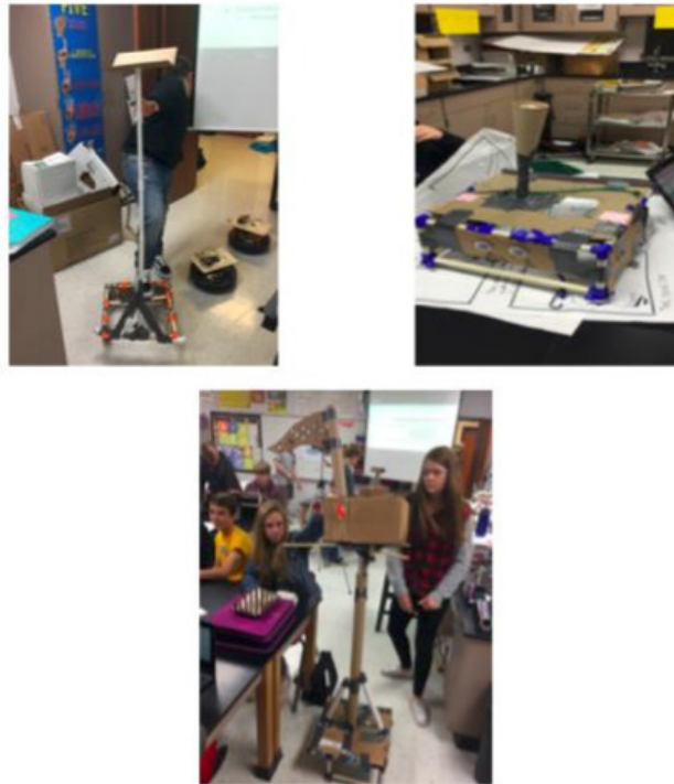
Safety robots (3) designed to help students with disabilities to evacuate during emergencies