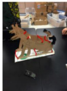
Safety robot with live video feed during lockdown procedures