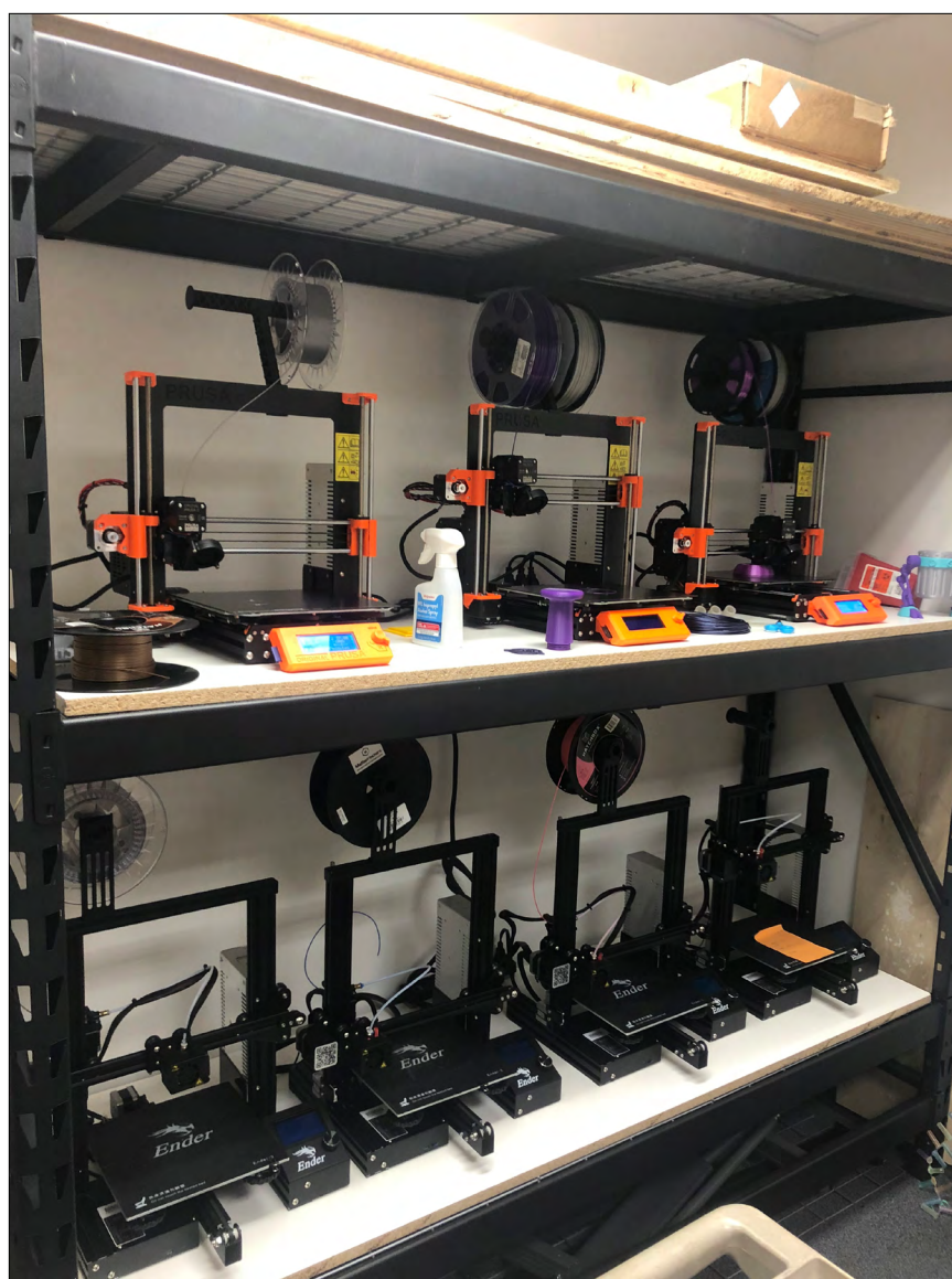
FIGURE 1. Prusa i3 MK3 3D printers in the CUPS makerspace.

In addition to 3D printing their models and composing reflections on their experiences, students created research posters as part of their final project (see Figure 2). Students presented their research findings and 3D models during an academic symposium at the end of the summer. This event was modeled after the University of Colorado Undergraduate