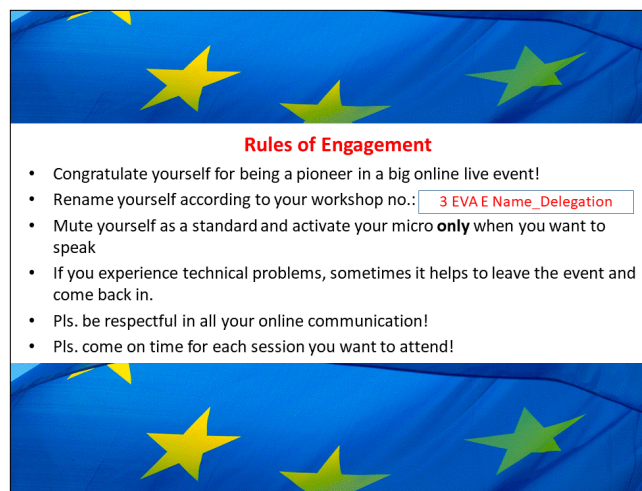
FIGURE 3. Rules of Engagement—with an encouraging start, addressing the participants as pioneers (bullet point 1).

Additionally, an appreciative, encouraging and warm tone was used for all communications. For example, the e-mail