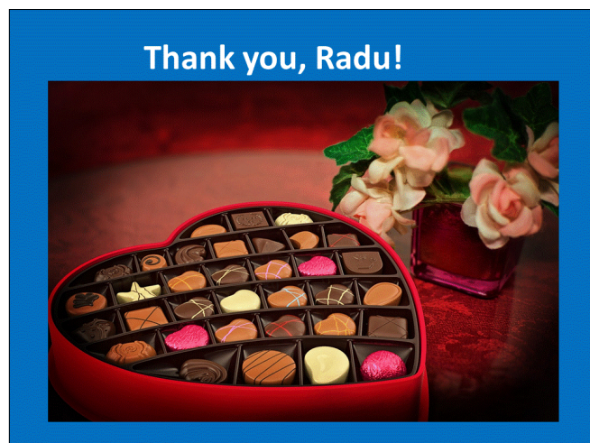
FIGURE 5. Virtual Acknowledgements for speakers giving expert talks at VSED.

environment. Fundamental design principles that had been agreed upon, such as flexibility, empathy, and humor, served as key design principles during this process.