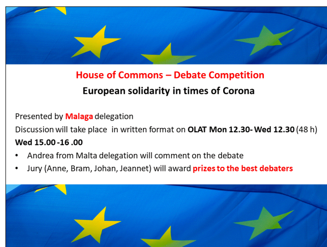
FIGURE 6. Screenshot of the announcement for the debate competition, with information on which national delegation kicks-off the debate, the time frame for asynchronous written participation, and names of faculty acting as commentators or jury members.

The Welcome session also needed to be adapted to the online format. It traditionally entails a keynote speech by an expert on European social policy. To acknowledge the pandemic at the start of the event, the committee suggested that the keynote topic should reflect the pandemic situation. The topic for the keynote was thus defined as "Challenges for the European Union in a Time of Crisis & Uncertainty". Additionally, in order to facilitate interactions in the ten student-led topical workshops on Day 2, a synchronous 20-minute getting to know each other activity was included in Breakout Rooms.