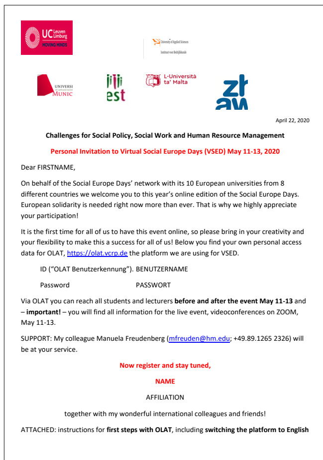
FIGURE 2. Personal Invitation Letter where FIRSTNAME was replaced by the first name of the respective participant, and that provided contact details of a support assistant.