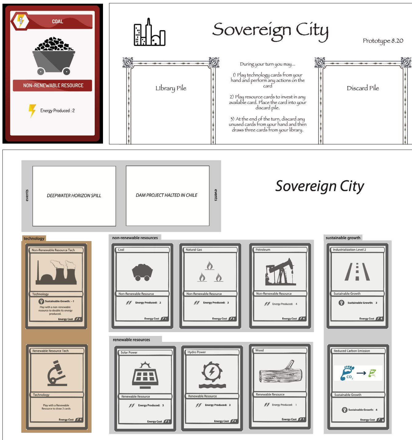
FIGURE 2. a (top left) Cards were redesigned to have simple, brightly colored graphics. b (top right) An A5-sized play-mat for each student showed how each player's cards should be arranged and included a simple review of the game rules. c (bottom) An A3-sized play-mat showed students how to set the game up. Art by Shirin Rafie.

correctly and quickly. They were concerned that students would not read the rules on their own, would not do as they were instructed, and would be confused and off-task during game play. To address the concern, the teachers assembled a slide presentation to explain how the game is played that they intended to present to students at the start