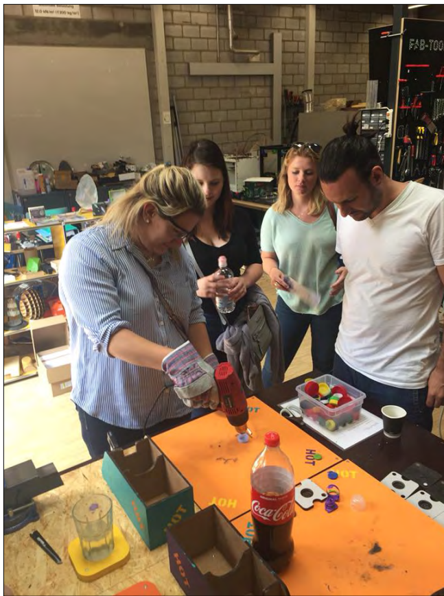
FIGURE 6. Study abroad students at the FabLab Luzern makerspace, using a tool to melt a plastic bottle cap to make a shirt button.