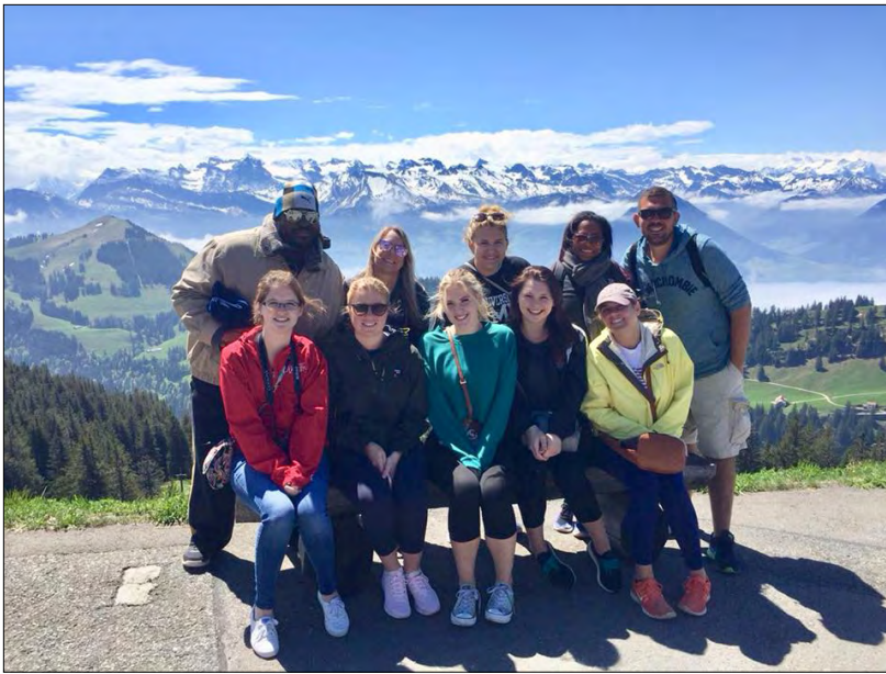
FIGURE 4. The University of Tampa “Teaching and Learning Innovation in Switzerland” study abroad students and instructors at Mount Rigi.