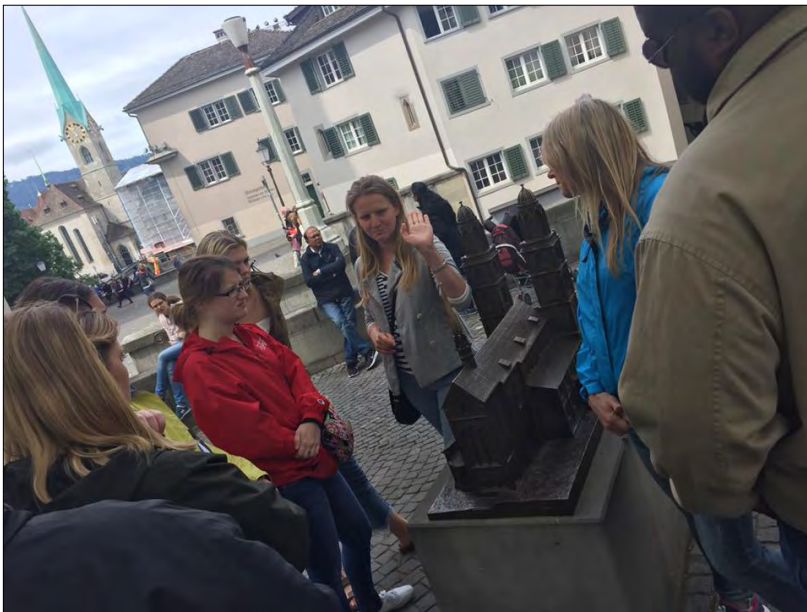
FIGURE 5. Study abroad students listening to a tour guide share information about the city of Zurich.

teaching and learning in a range of educational settings. One of these activities was the visit to The Lucerne School of Art and Design, which is the oldest college of art and design in German-speaking Switzerland. During the visit, the group interacted with some of the research groups. Of particular interest was a meeting with the “visual narrative” research group. This research group explores narrative, staging, and interpretation in linear and non-linear media, investigates the use and reception of these media, and designs new communication strategies and formats in visual media.