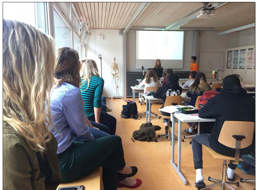
FIGURE 8. Study abroad students in a high school classroom, observing a presentation by students from the Kantonsschule Schüpfheim/Gymnasium Plus

“The semester after this program I entered my senior year completing my undergrad in elementary education. This program provided me with a different perspective on classrooms and educational systems of different countries. The program helped me to develop skills in my teaching practices that my peers had not been exposed to.”