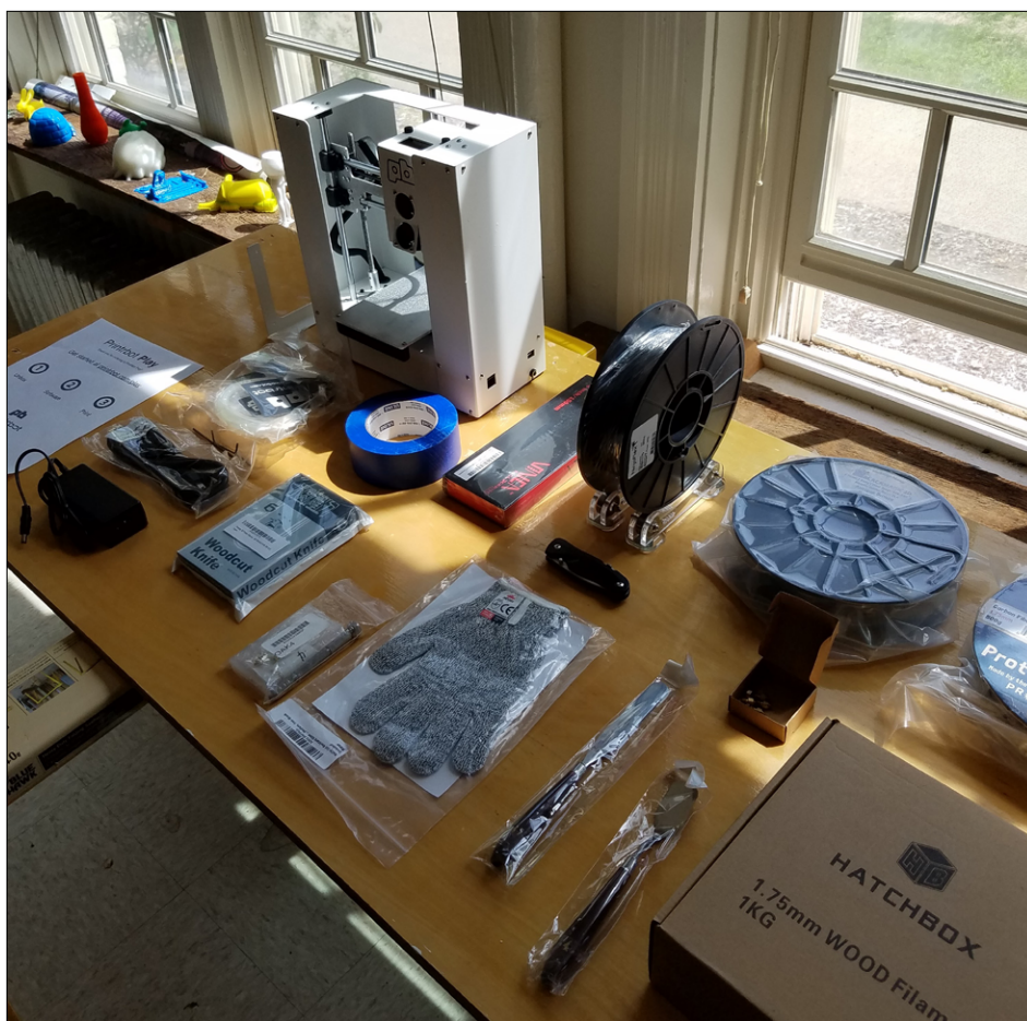
FIGURE 2. Early collection phase of the components in the DigiFab Kit. Note the roller carriers for the filament spool that enable the printer to be more compact.

comprised of various forms of manufacturing (e.g., numerical milling machines, laser cutting, welding, electronics manufacturing) including 3D printing. The capacity of 3D printing to quickly and accurately manufacture parts positions it well as a key element in learning through making. Indeed, research has shown that makerspaces are the dominant location where the majority of entry-level 3D printing occurs (Bosque, 2015). Public schools and libraries are exploring forms of maker inquiry and problem solving that is associated with its environs. Makerspaces may be difficult to establish in many settings because they can be expensive, require a lot of space, and present safety concerns for student and teacher users. The DigiFab Kits are intended to address these concerns by providing carefully selected resources designed to function well in diverse learning spaces (see Figure 2).