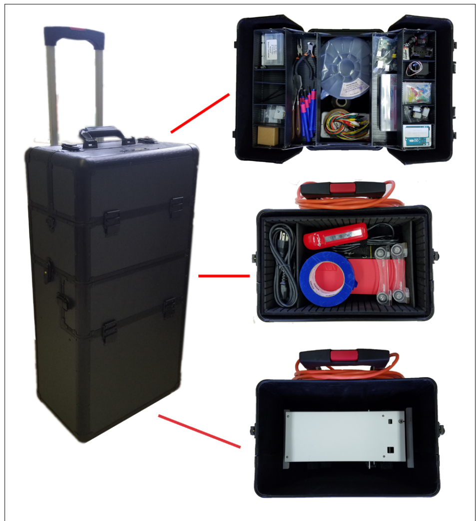
FIGURE 1. Stackable roller case allows for three-tiered packing: The top tier holds tools and electronics, the middle tier holds handheld scanner and power cords, and the bottom tier holds the Printbot Play 3D printer.

My decisions concerning the design of the DigiFab Kit are motivated by material and conceptual components of a transdisciplinary arts curriculum utilizing digital fabrication. Transdisciplinarity “concerns that which is at once between the disciplines, across the different disciplines, and beyond all discipline” (Nicolescu, 1999, p. 3). The transdisciplinary mode of learning has two characteristics: (a) it is a priori positioning of knowledge as interconnected, complex, and transcending total categorization; and (b) it arises from the need to address complex problems. Ultimately, transdisciplinarity may suggest disciplines that have yet to be defined,