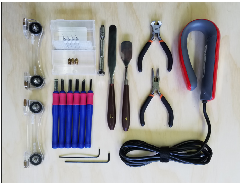
FIGURE 4. The range of tools relevant to 3D printing including from left to right roller carriers for filament spool, replacement printer parts, hand carving tools, allen wrenches, spatulas, pliers and an XYZ Handheld Scanner.

resources in the form of slideshow presentations showcase examples of 3D printed objects being used in design projects. Electronic components are included in the kit to suggest concepts that activate the 3D printed objects (see Figure 3). I also include already printed objects in the kit to demonstrate important printing concepts such as understanding the needs for material supports or analyzing build orientation.