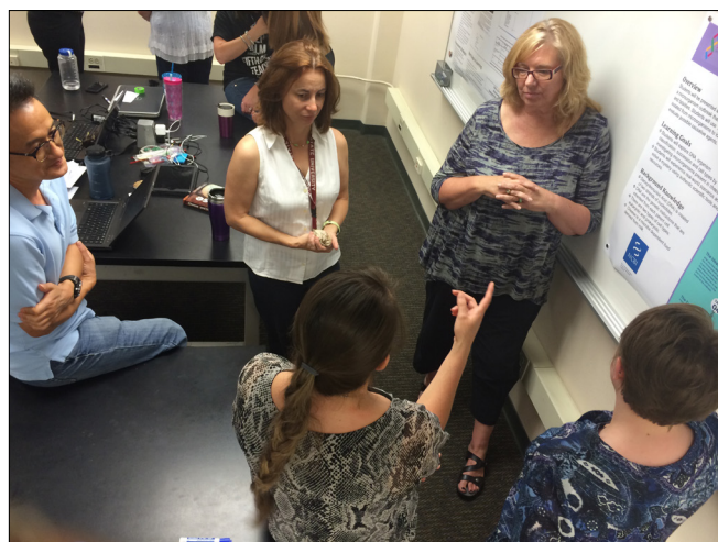
FIGURE 3. Yr 2 CTFs present their cheese activity poster and receive feedback from two NMSU biology faculty members (who are also members of the STC project advisory board).

We were thus left with the challenge of designing and implementing some kind of workshop culminating activity that would help build confidence with the newly designed activity, and also provide some kind of consolidating documentation that the teachers could refer to during the academic year. We decided to hold a poster session on the last day of the second year workshop. Each CTF team designed