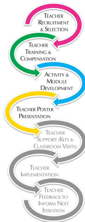
FIGURE 2. Annual project cycle of STC.

The next five days of the second workshop continued to introduce and reinforce more sophisticated life sciences content and concepts. However, a major focus was to introduce the CTFs to online DNA sequence databases and tools to analyze DNA sequences. We purposefully revisited