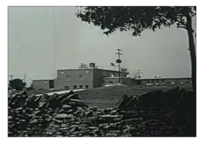
FIGURE 1. MPATI courses were transmitted to six states (Ohio State University, 1964).

Although a novel approach to distributing instruction, the MPATI officially ended after 10 years in 1971 due to an inability to raise enough money to fund the maintenance of the aircraft. This design case will highlight how the novel conception of the MPATI was the first form of satellite television