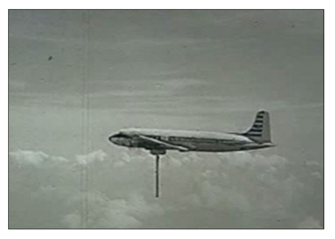
FIGURE 2. Televised broadcasts were aired from the MPATI planes (The Ohio State University, 1964).