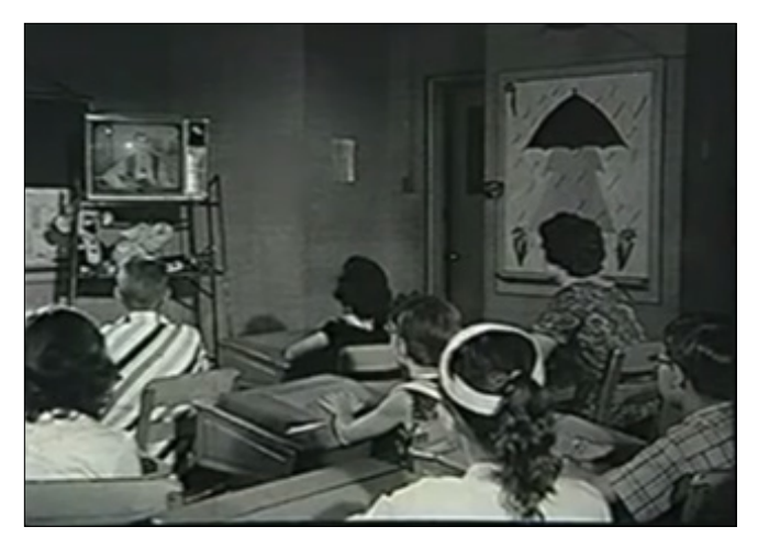
FIGURE 4. A class prepares to watch a televised broadcast (Ohio State University, 1964).