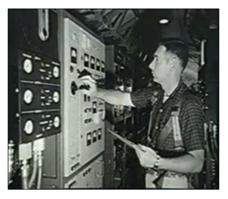
FIGURE 3. Broadcasting equipment stored on a DC-6 (The Ohio State University, 1964).

Principals and teachers reviewed the MPATI curricular offerings together to determine if the televised instruction