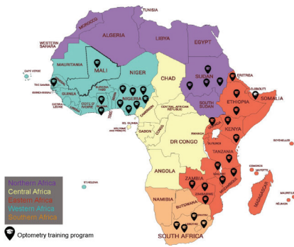
Optometric education in Africa