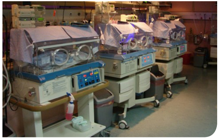
Public sector change

I obtained my PhD in Nursing in Midwifery and Neonatal Nursing from the North-West University, in South Africa, and my dissertation was entitled the development of 'Best practice guidelines for neurodevelopmental supportive care of the preterm infant in South Africa (Lubbe, 2010). The first phase of the study was to identify the components of NDSC to determine how we could implement this in the South African context while programs such as NIDCAP were considered too expensive and time intensive for the South African context at this time. Some important publications followed from this research and are used in clinical practice, such as the 'Integrative literature review defining evidence-based neurodevelopmental supportive care of the preterm infant (Lubbe et al. , 2012) and more recently the publication of 'Best practice guidelines: Neurodevelopmental supportive care of the preterm infant – condensed guide for clinicians (Lubbe, 2019). Further research in the field of NDSC then funded by the National Research Fund (South Africa) from