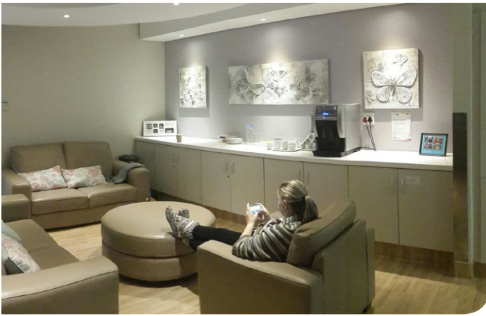
The hospital after the renovation

Participants currently include both public and private hospitals across the country. The initial phase of the study was the identification of champions in the participating hospitals to act as project coordinators within their facilities. These champions were then provided with leadership training based on the Kouzes and Posner leadership theory and thereafter they are supported for a period of 10 months to implement the various components of NDSC in their facility: 1) Positioning, handling and KMC, 2) Pain management, 3) Neurosocial development, 4) Environment and sensory management, 5) Feeding and non-nutritive sucking, 6) Breastfeeding in the NICU, 7) Individualised, family-centered care, 8) Transport, 9) Procedures using NDSC, and 10) Hospital-to-home. Assessment of the status of NDSC is done before, midway and after the implementation of the various components, and champions experiences of the implementation is also determined to provide valuable information for scale-up of NDSC implementation. The INDeSC tool is used to determine the level of implementation of NDSC in participating units and provides a guideline on areas that require attention.