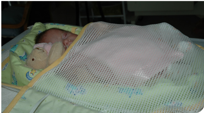
Little Steps Nest

Awareness of developmental care grew during this time, with many healthcare professionals embarking on studies in this field but focusing on selected aspects of the care model - some focussed on sensory integration issues, while others focussed on kangaroo mother care or parental support. Developmental care was still not the underlying model used in the NICU, but rather a nice-to-have add on. However, in the process, some supporting products have been developed and manufactured within South Africa, such as the Little Steps Nest.