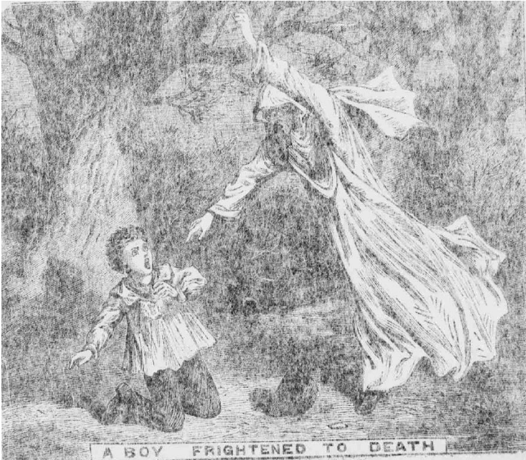
Figure 2 "A Boy Frightened to Death" from the Illustrated Police News , 1873.