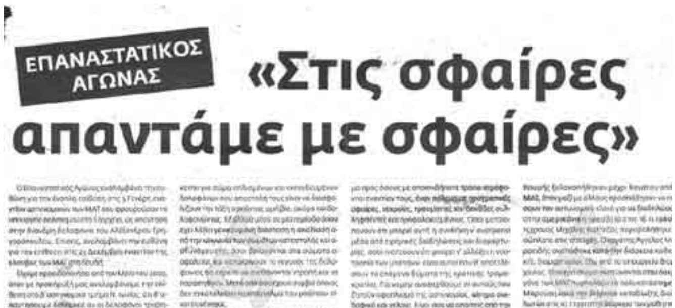
Epanastatikos Agonas, or Revolutionary Struggle , is a Greek group known for its bombing attacks on Greek government buildings, banks and the American embassy in Athens. Both the European Union, and U.S. Secretary of State Hillary Rodham Clinton have formally designated Revolutionary Struggle as a terrorist organization. Epanastatikos Agonas has been quite consistent in using Fedra Sans for its flyers. And no, they didn’t buy the licence.

Type design, by contrast, was originally dependent on the expertise of the maker: the final typeface was only as good as the skill of the punch-cutter. The first examples of type design separate from the craft of manufacturing come from the