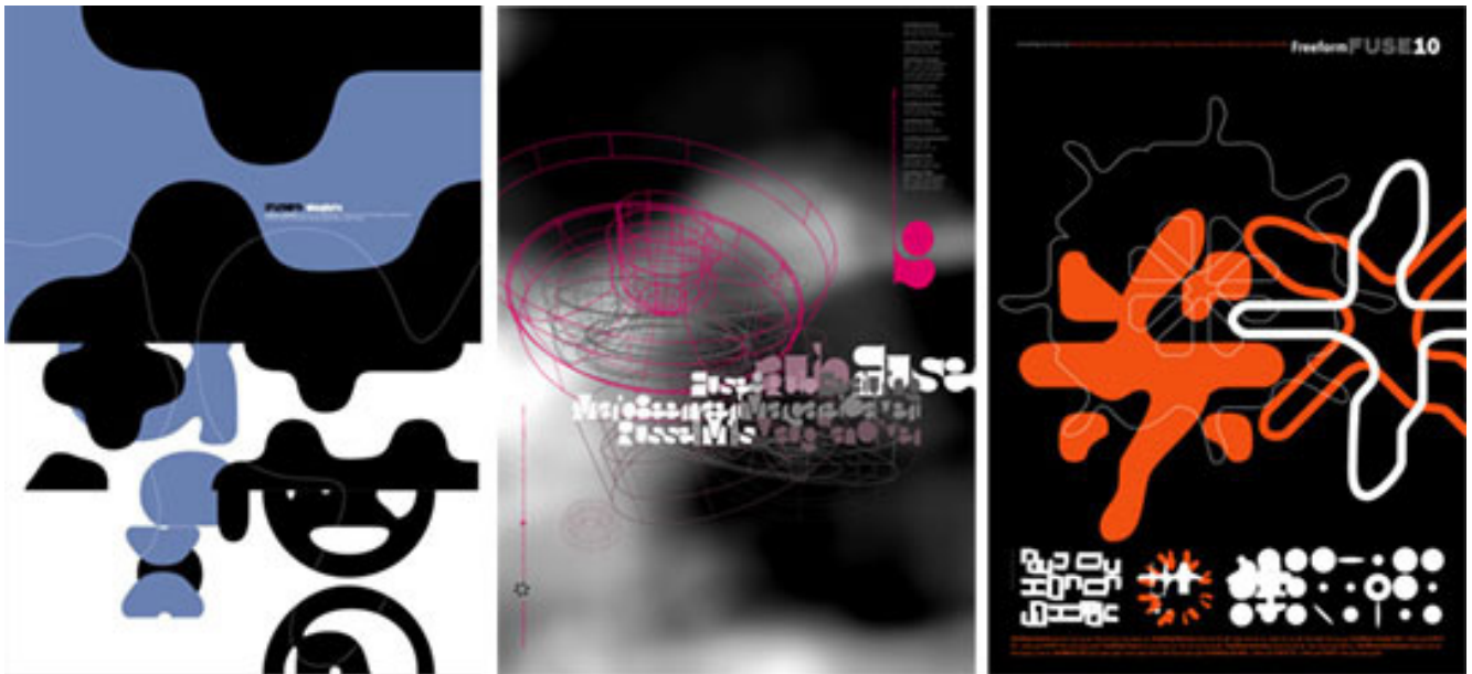
FUSE, quarterly forum for experimental typography initiated by Neville Brody and Jon Wozencroft in 1990.

remain in its semantic form, one has to rethink the whole frame of the discipline. Would you hire a ‘conceptual’ plumber to fix your sink?