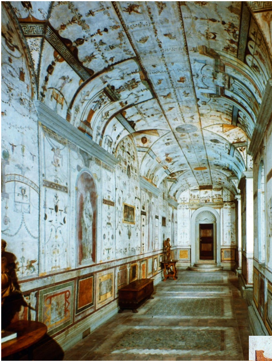
Figure 1. Giovanni da Udine / Raphael's workshop, Loggetta of the Cardinal Bibbiena, The Vatican Palace, 1519.