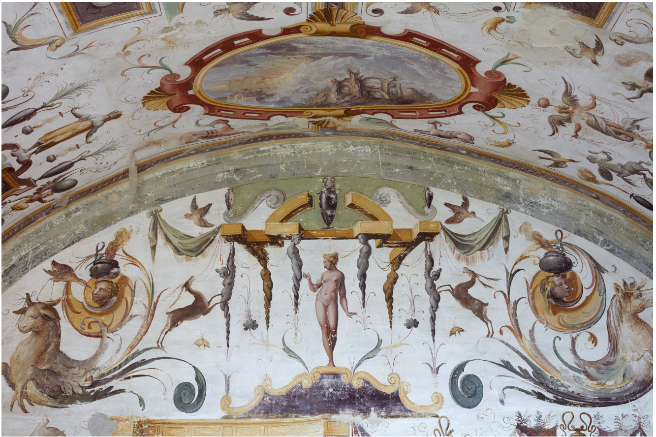
Figure 5: Serpentine figures within the grotesques of Cesare Baglione and his circle, Sala dei Paesaggi, Castello di Torrechiara, c. 1590.