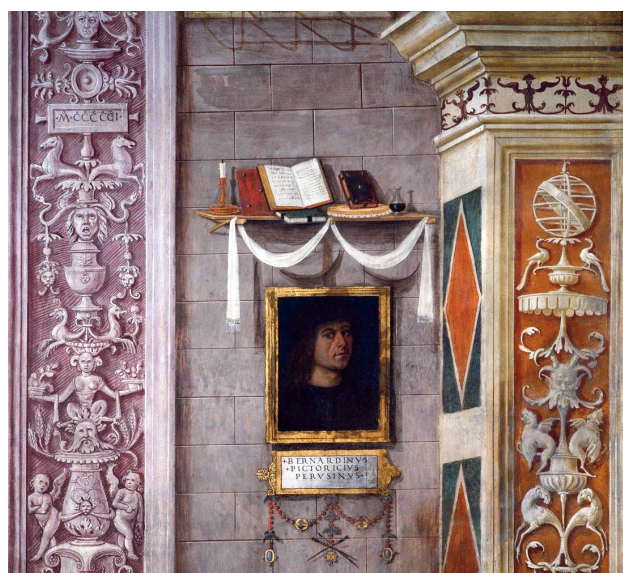
Figure 6: Pinturicchio, detail with self-portrait and pilasters with grotesques and the date "MCCCCCI" (1501) within his "Annunciation", Cappella Baglione, Collegiata Santa Maria Maggiore, Spello.

Around 1500, the perception of grotesques seems to be oscillating between an extraordinary fascination and a remarkable fear of movement—an oscillation between, on one hand, a new self-confidence on the part of the artist and an appreciation of his imaginative power, and, on the other hand, a nagging concern about blasphemy by interfering with a creative field reserved for God: in simulating life itself. 13 Signorelli's grotesques are generated from the old attitude to movement in art as terrifying. But there are limits to the terror. The figure depicted as responding to the surrounding frescoes does not appear to be really frightened by them. Moreover, and not least, the figure is not alive. The beholder would not mistake this, and rather appreciate that Signorelli's representation is art, not life. The absorption with the affective potential of the imagery is remarkable. The representation of the reaction of the figure, observing the painting of which he is part, is, quite literally, a self-aware image. 14 Signorelli exhibits the zone of transition between the pictorial space and the space of the viewer, as it had been done in painting for at least a couple of centuries, although not quite as radically (Sandström, 1963; Shearman, 1992). This breach of the boundaries between the image and the spectator would become a leitmotif in the art of