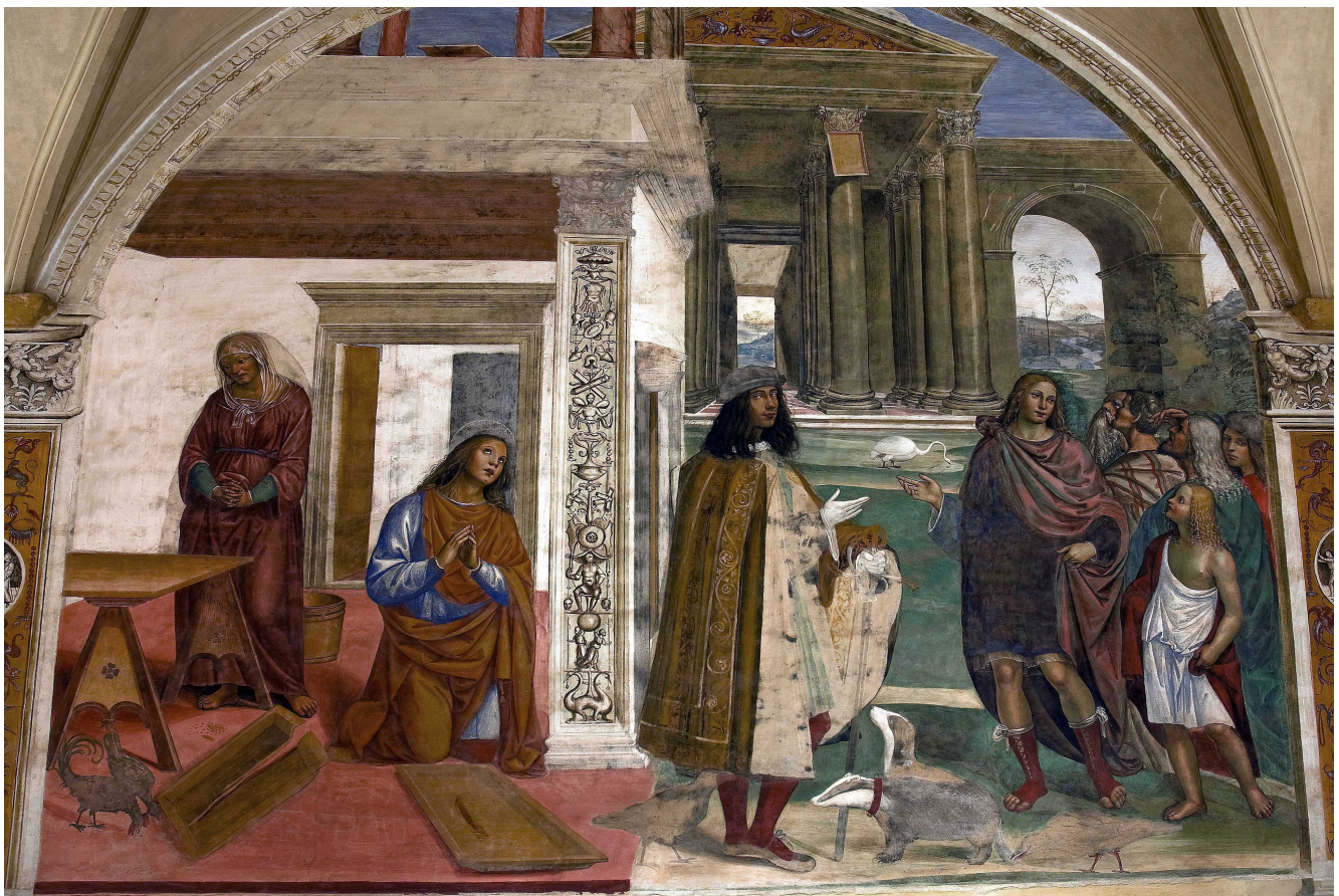
Figure 7: Sodoma (Giovanni Antonio Bazzi), self-portrait with his two badgers and his tame, talking raven. He is standing next to a pilaster with grotesques and dominates the center of the scene "Benedict Repairs a Broken Colander through Prayer". The cloister of the Abbey of Monte Oliveto Maggiore, 1505-08.