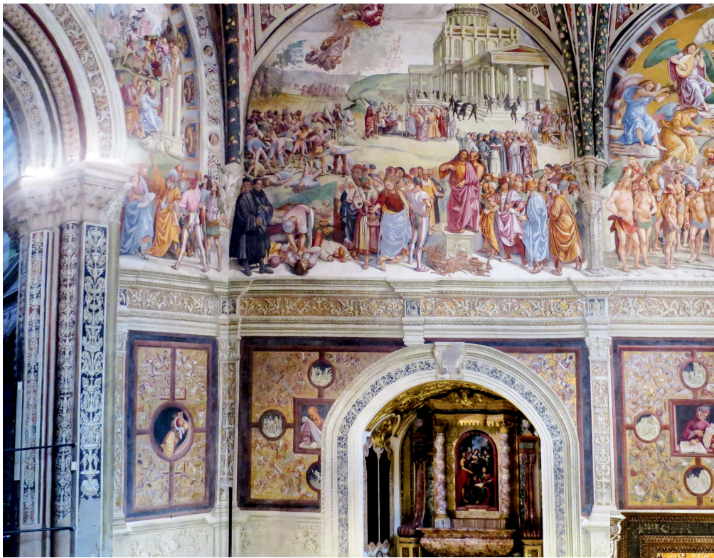
Figure 3: Luca Signorelli, "The Last Judgement", Cappella Nuova, Cathedral of Orvieto, 1499-1504.