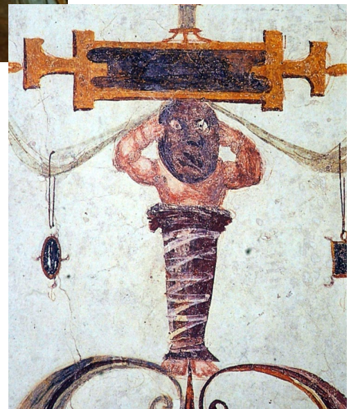
Figure 2: Giovanni da Udine / Raphael's workshop, detail from the Loggetta of the Cardinal Bibbiena, The Vatican Palace, 1519.

Signorelli situated the historia of The End of Time above a zone of elaborate, monstrous grotesques with framed portraits of ancient poets. In one case, such a figure is represented as transgressing his frame and reacting as if startled by the painting that surrounds him (Figure 4). 4 Apparently, the monstrous grotesques that transform from one creature into another through dynamic, spiraling movements are highly affecting to this figure—a figure which assumes a stand-in position for the spectator in the overall spatial composition of the chapel. This play with levels of reality in the chapel's fresco decoration is in line with a century long tradition, where for instance small representations of prophets in the Old Testament would be included as formal and conceptual framing of a New Testament subject. Such figures often confront the viewer directly by transgressing the space in which they are represented, for instance through protrusions of their