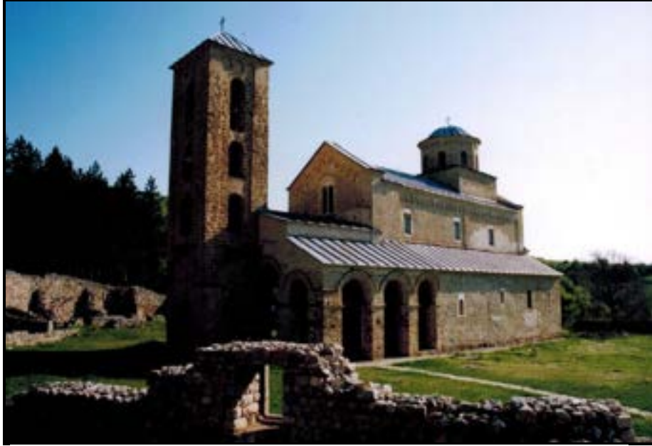
Sopoćani Monastery, South-West Serbia (Ras-Prizren Diocese), in the 1990s was one of the most attractive places for future monks, and a shelter for "God seeking souls". The corruption affairs and the schism in the Diocese in the mid-2000s prompted more than a third of the monks so far to either leave monasticism for good or to transfer elsewhere in Serbia.