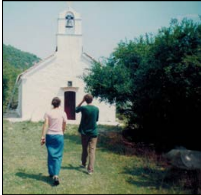
An Orthodox Church: With the revival of Orthodoxy in the beginning of the 1990s many formerly dilapidated churches have undergone renovation and refurbishment. In this photo the author visits one of those churches that was "rediscovered", as the Church puts it, as "an important spot for Serbian Orthodoxy", even though no important historical event is related to this particular church, and even though it was built before the 19th century. At that time the idea of Serbian Orthodoxy as such did not exist.

Human rights NGOs operating in Serbia, along with some politicians and independent intellectuals, claim that Serbia's constitutional secularism lately has been threatened by the involvement of the SOC in the public discourse, and by its conservative agenda. Censuses and public opinion surveys reveal that more than 90% of Serbs label themselves as Orthodox, and say that they believe in God (Simić 2011: 15). This data differs to a great extent from the data from surveys and censuses conducted prior to the fall of the communist regime in former Yugoslavia, a period when the Church's political and social influence was significantly muted (Blagojević 2008, 2009).