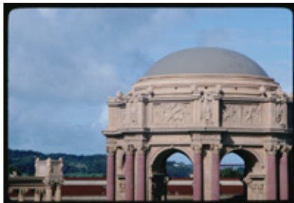
03/16/1968 Palace of Fine Arts, San Francisco