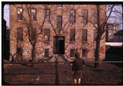
West of Chicago and Chicago 03/07/1946 Urchin looks at old 3-story tenement set far back in low yard