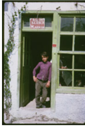
04/27/1965 Doorway, Athens