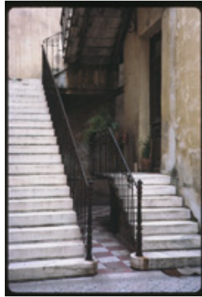
Travels to Damascus and Beirut