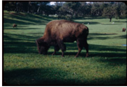
Travels to Colorado