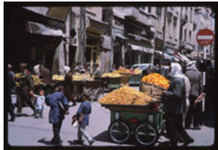
05/06/1965 Fruit carts, Damascus