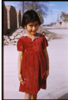
1952 In California