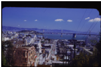
03/20/1952 View east from top of Broadway toward the Bay and Bay Bridge, San Francisco