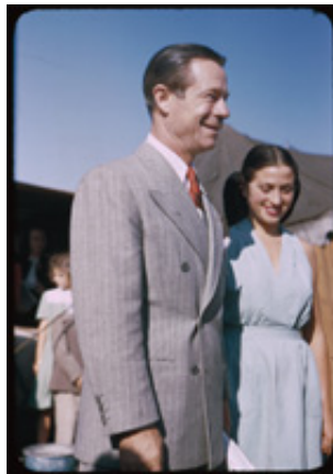
08/11/1946 Actor Joe E. Brown