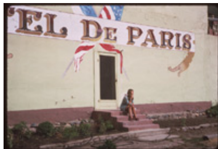
Travels across most of America