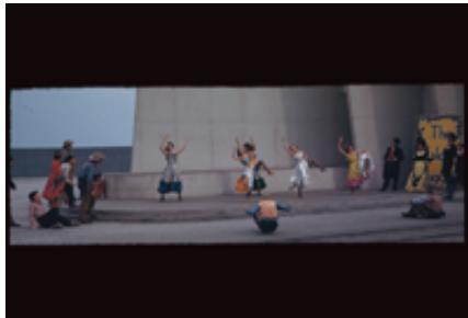
Attends Railroad Fair, Chicago 09/17/1948 Dancing girls of the Gold Rush days.