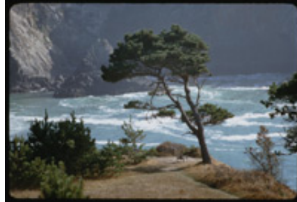
1968 In California