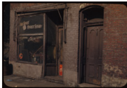
Travels to St. Louis, Missouri