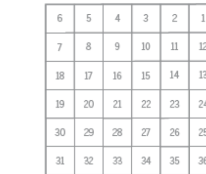
General diagram of Congressional township showing numbered sections. Ideal sections are 1 mile by 1 mile squares.