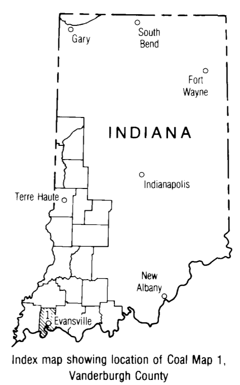
Index map showing location of Coal Map 1, Vanderburgh County