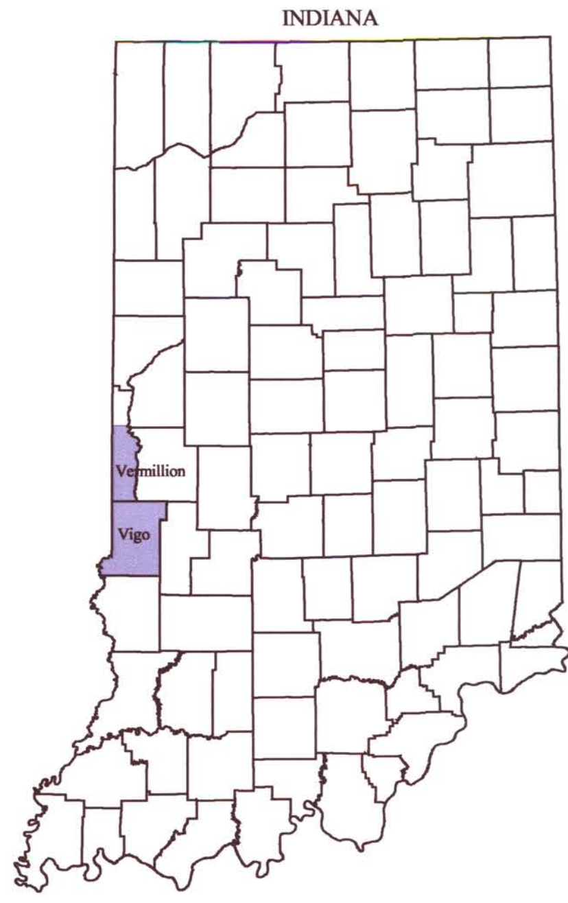
Index map of Indiana with Vigo County and the southern two-thirds of Vermillion County shown in blue.

For more information about this map, contact: Indiana Geological Survey 611 N. Walnut Grove Bloomington, IN 47405-2208 812.855-7636 IGSinfo@indiana.edu