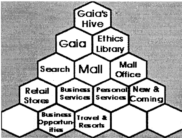
Figure 1: Hive image-map; a click-able set of links embodied in a graphic image from a Gaia's Hive World-Wide Web page

If one is versed in Gaian discourse, Figure 1 also communicates a complex belief matrix. In computer jargon, “hiving” refers to the use of idle network space to speed up network operations. In Gaian thought, it also represents an accelerated process toward “Emergence,” the moment when the entire planet gains consciousness through the aggregate network of human thoughts. As in St. John’s Apocalypse, mind will unite with deity; in this case, the living, volitional biosphere of Earth: Lovelock’s Gaia.