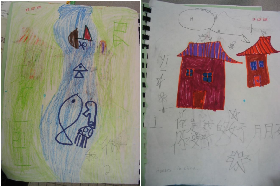
Figure 1. Min's "My China" and "Houses in China"

Min responds, "Well, I love my China. [pointing places in a river that runs down the center of the page in her journal (Figure 1)] There and there and there. I'm going to make rain."