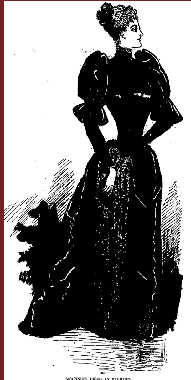
MOURNING DRESS IN FASHION.