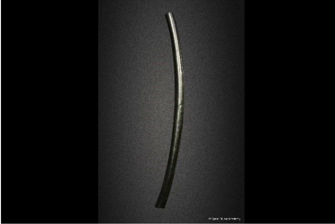
Figure 2: A drumstick.