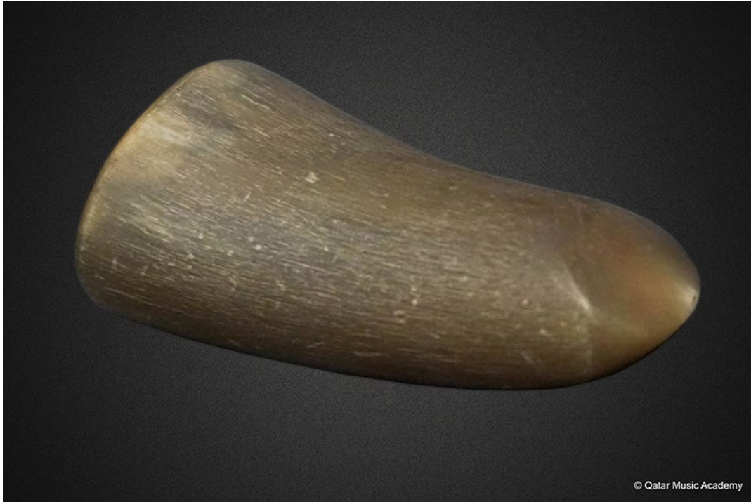
Figure 3: Miswaqah.