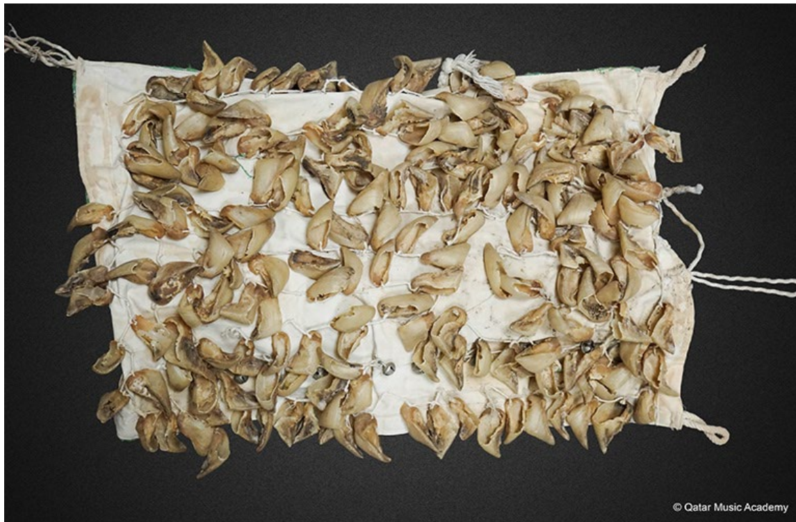
Figure 1: Manjur.

The following images show some of the instruments and tools used in Nūbat al-Ṭambūra: