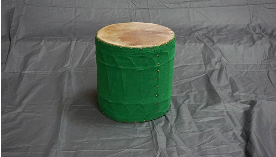
Figure 4: Tabl.