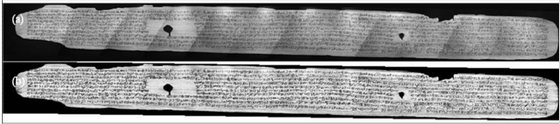
Figure 1. Palm front images before and after digital restoration.