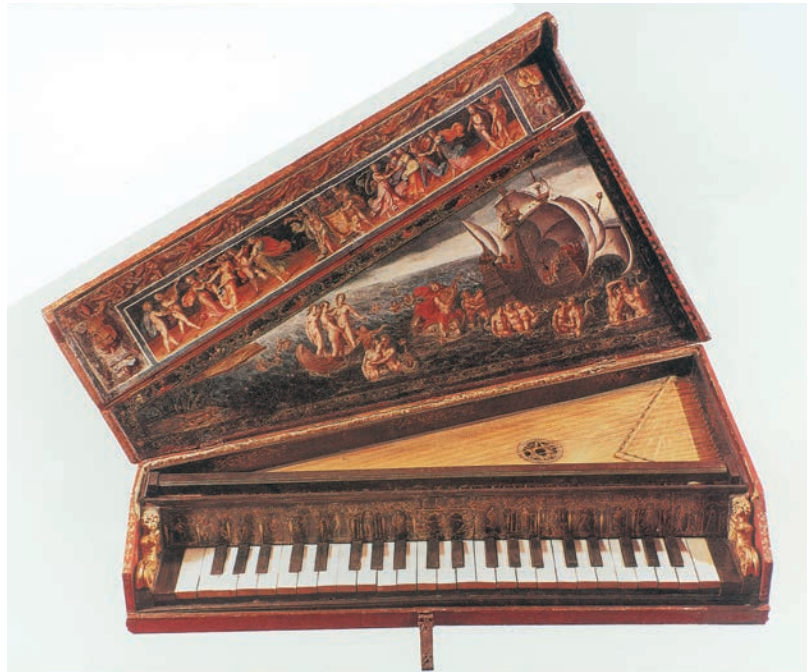
3. An anonymous sixteenth-century octave spinet. Strumming his lute (a “modern” replacement for the lyre), Arion is borne triumphantly to shore on the back of a dolphin. In this version of the legend the dolphins evidently capsized the ship, sending the larcenous sailors into the sea. London, Victoria and Albert Museum.