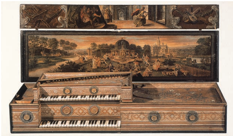
5b. The child of the 1580 van der Biest has been removed from its case and placed on top of the mother, with the latter's jackrail removed. The mother's jacks push up the backs of the child's keys, enabling the player to activate both sets of strings from the mother's keyboard. Nuremberg, Germanisches Nationalmuseum.