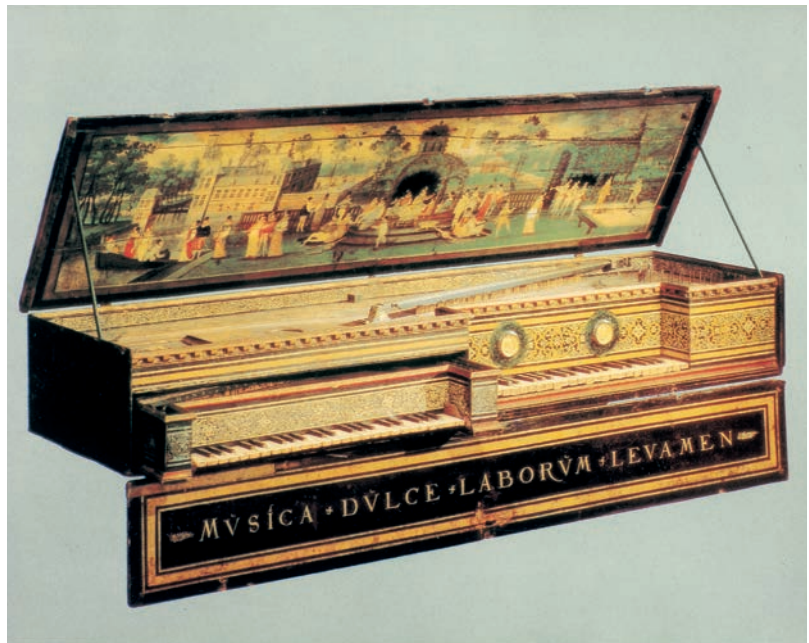
6. The 1581 Hans Ruckers mother and child muselar virginal. The child, on the left, has been partially withdrawn from its compartment. This is a particularly rich and striking instrument. New York, Metropolitan Museum of Art.