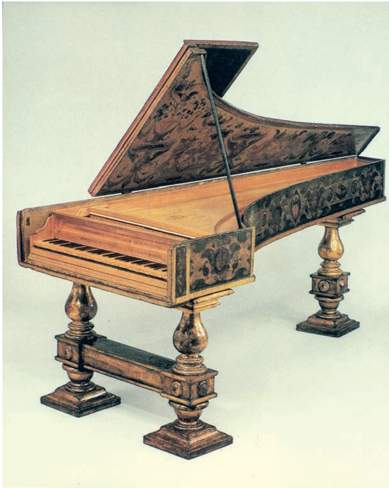
9. This large 1666 2x8' inner-outer by Girolamo Zenti is typical of his precise but unassuming work. The outer case has been redecorated. New York, Metropolitan Museum of Art.