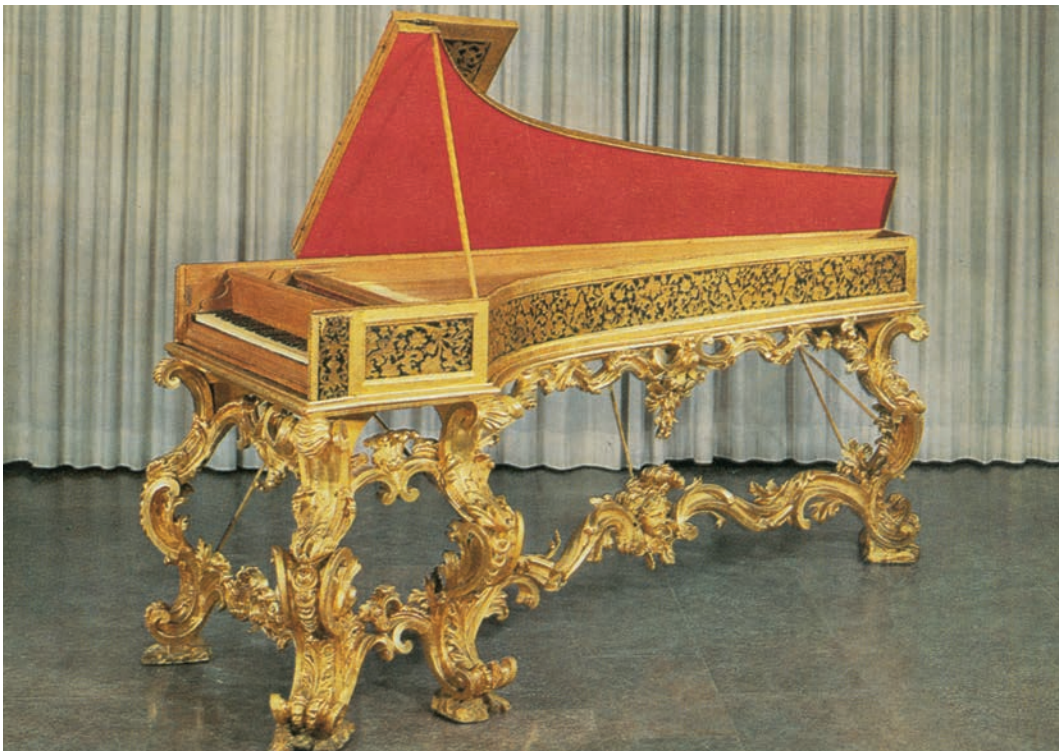
15. The 1697 harpsichord by Carlo Grimaldi. The gold-on-black decoration of the outer case was probably originally all gold. The Baroque stand visually overwhelms the harpsichord itself. Nuremberg, Germanisches Nationalmuseum.