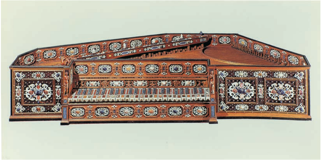
8. In both materials and workmanship, this 1577 instrument by Annibale dei Rossi is probably the most spectacular-looking virginal ever made. London, Victoria and Albert Museum.