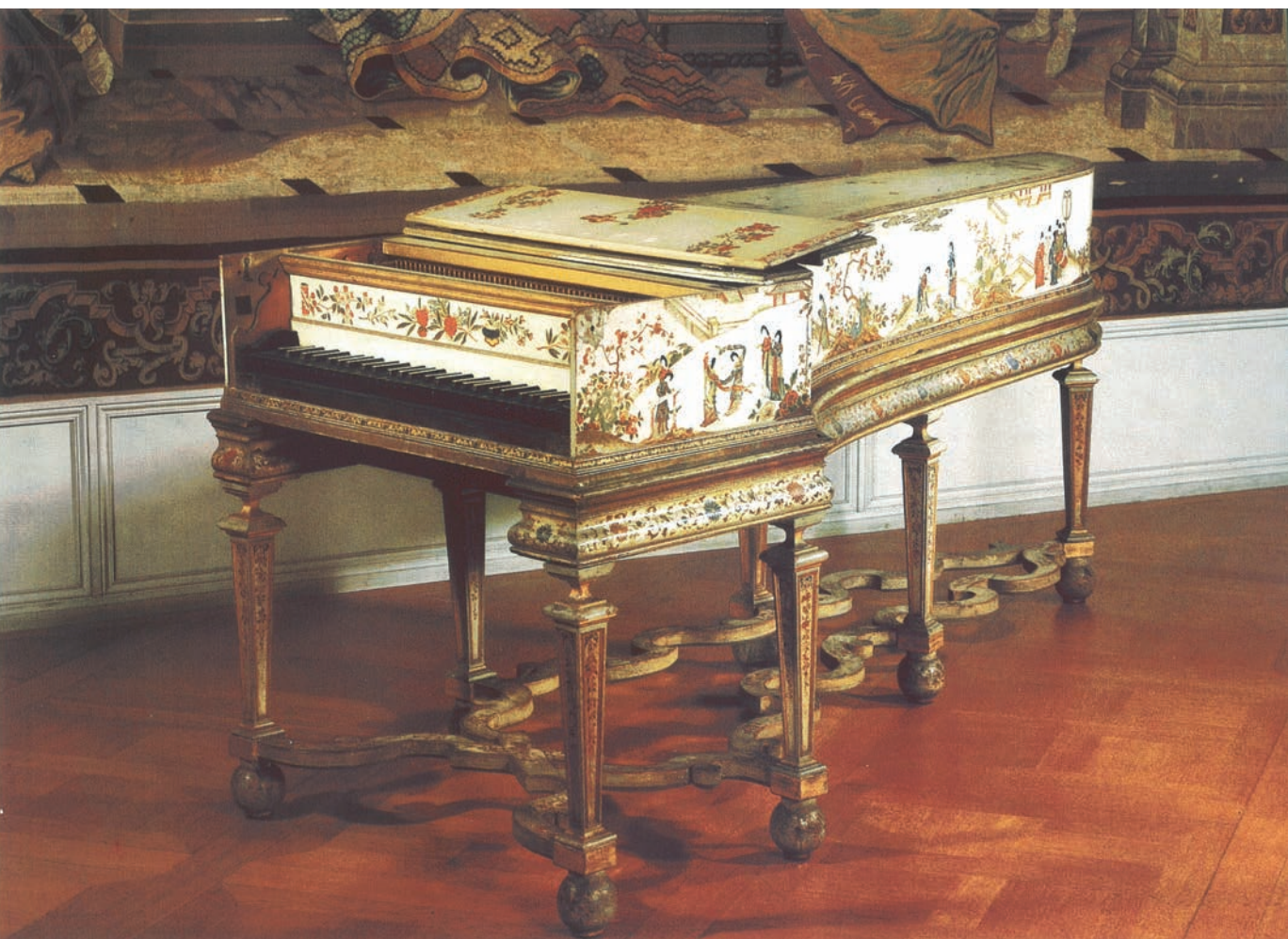
23. This beautiful 1702–04 single by Michael Mietke, known as “the white harpsichord” because of the porcelain-like appearance of its white ground, was finished by the famous japanner Gerard Dagly, decorator to the Berlin court of Frederick I.