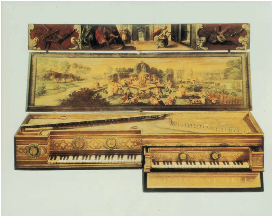
5a. The 1580 Martin van der Biest mother and child spinett virginal. The child's keyboard can be seen in the compartment in the right side of the case and can be partially withdrawn or even removed for playing. Nuremberg, Germanisches Nationalmuseum.