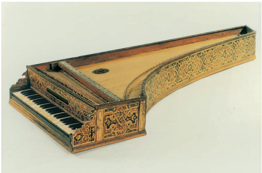
7. When new and fresh, the colors on the exterior of this 1560 inner by Guido Trasuntino must have been dazzling. It may never have had an outer case.