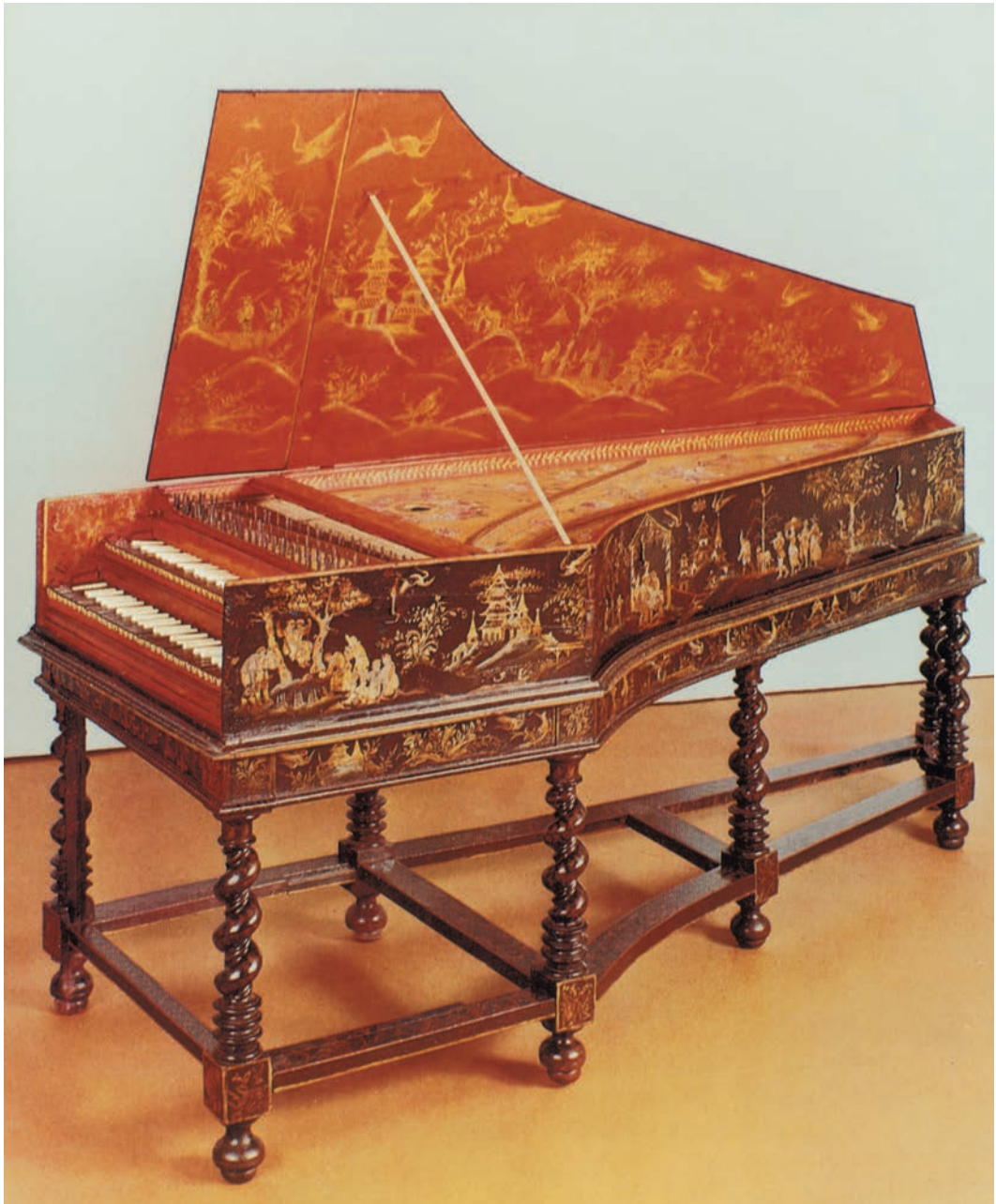
11. The 1681 Vaudry harpsichord. This beautiful court instrument is one of the finest extant examples of seventeenth-century French harpsichord making and decorating. London, Victoria and Albert Museum.