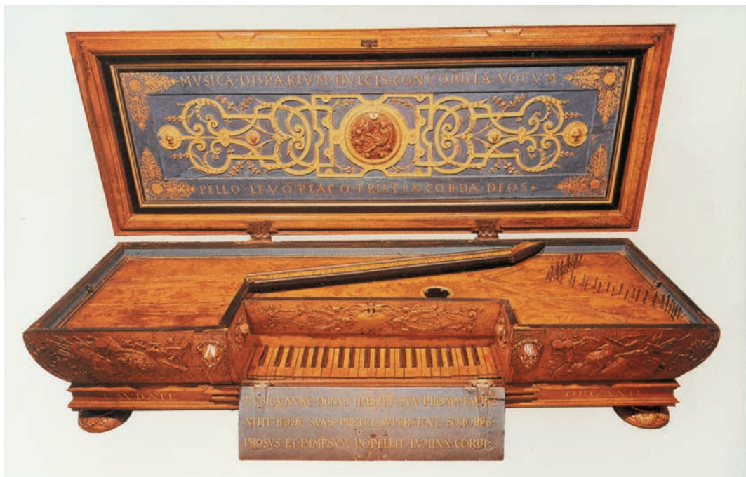
4. This anonymous instrument, built for the Duke of Cleves in 1568, is unique among Flemish virginals in its sarcophagus shape, carved case, little feet, and wealth of mottoes. London, Victoria and Albert Museum.