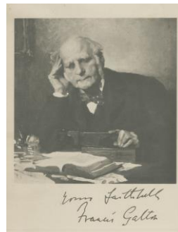
Francis Galton was the father of eugenics. [From Conclusions to Memories of My Life (1908). Wells Library, Indiana University, Bloomington, Indiana. ]