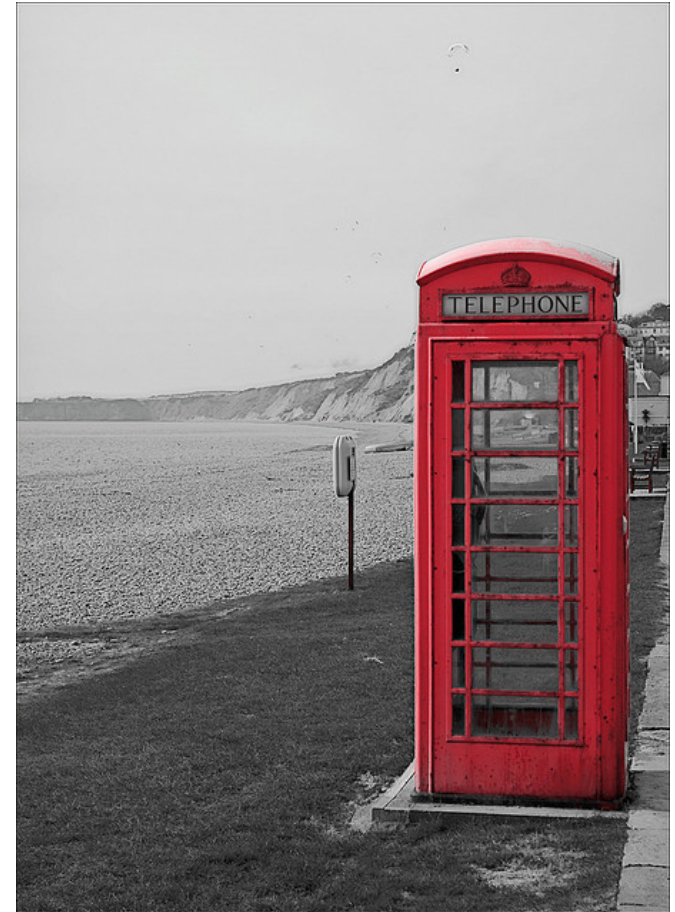
Flickr user Gary Tanner