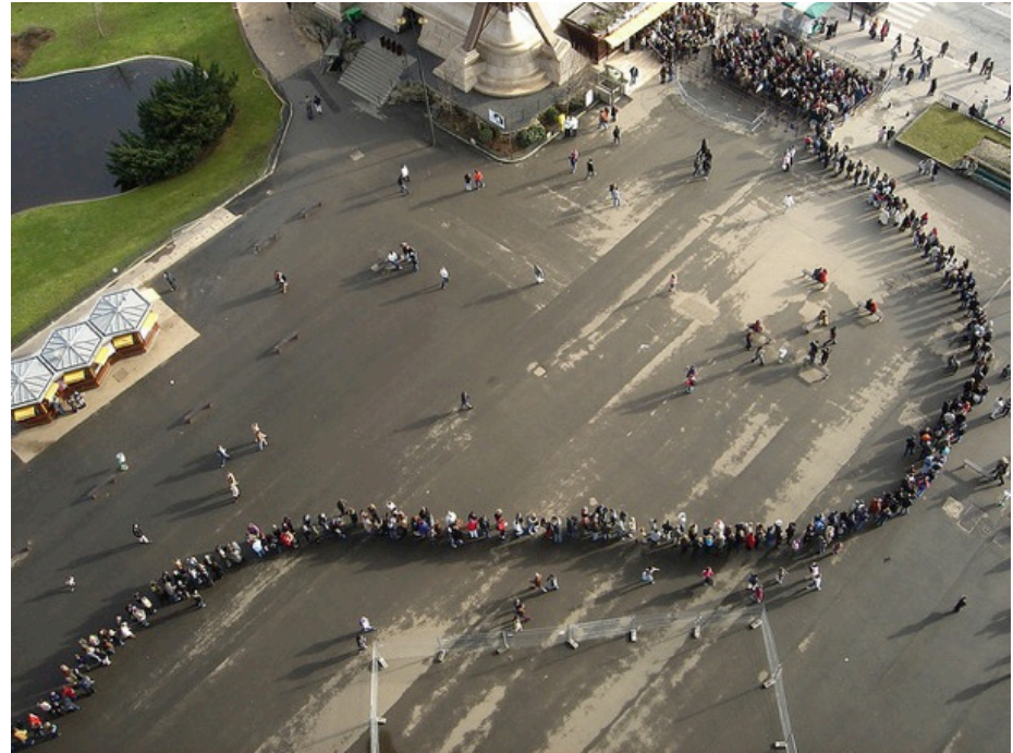
Flickr user Alexandre Duret-Lutz, Eiffel Tower Queue (2006)