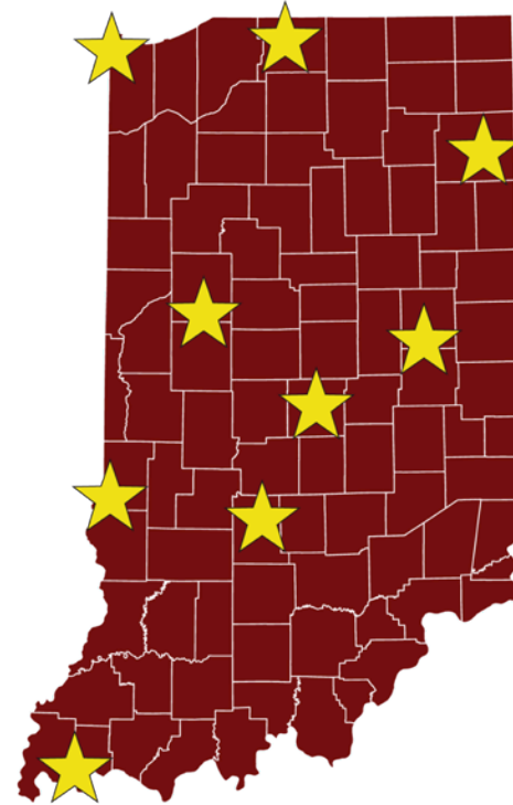
IU School of Medicine campuses and clinics