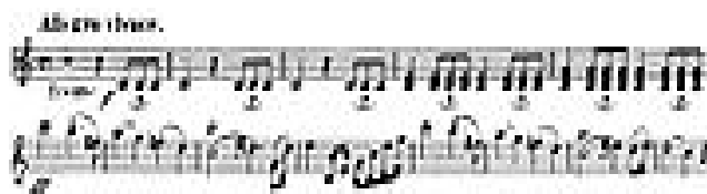
By Felix Mendelssohn