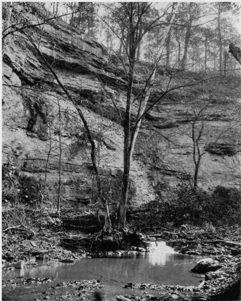
"The Mirror." Wall of Mitchell lime stone 100 feet high. "McCormick's Creek" canyon.

water from the lake, which was increased by the drainage on either side of McCormick's creek, cut and eroded the channel down almost to its present depth before the lake was fully drained. The