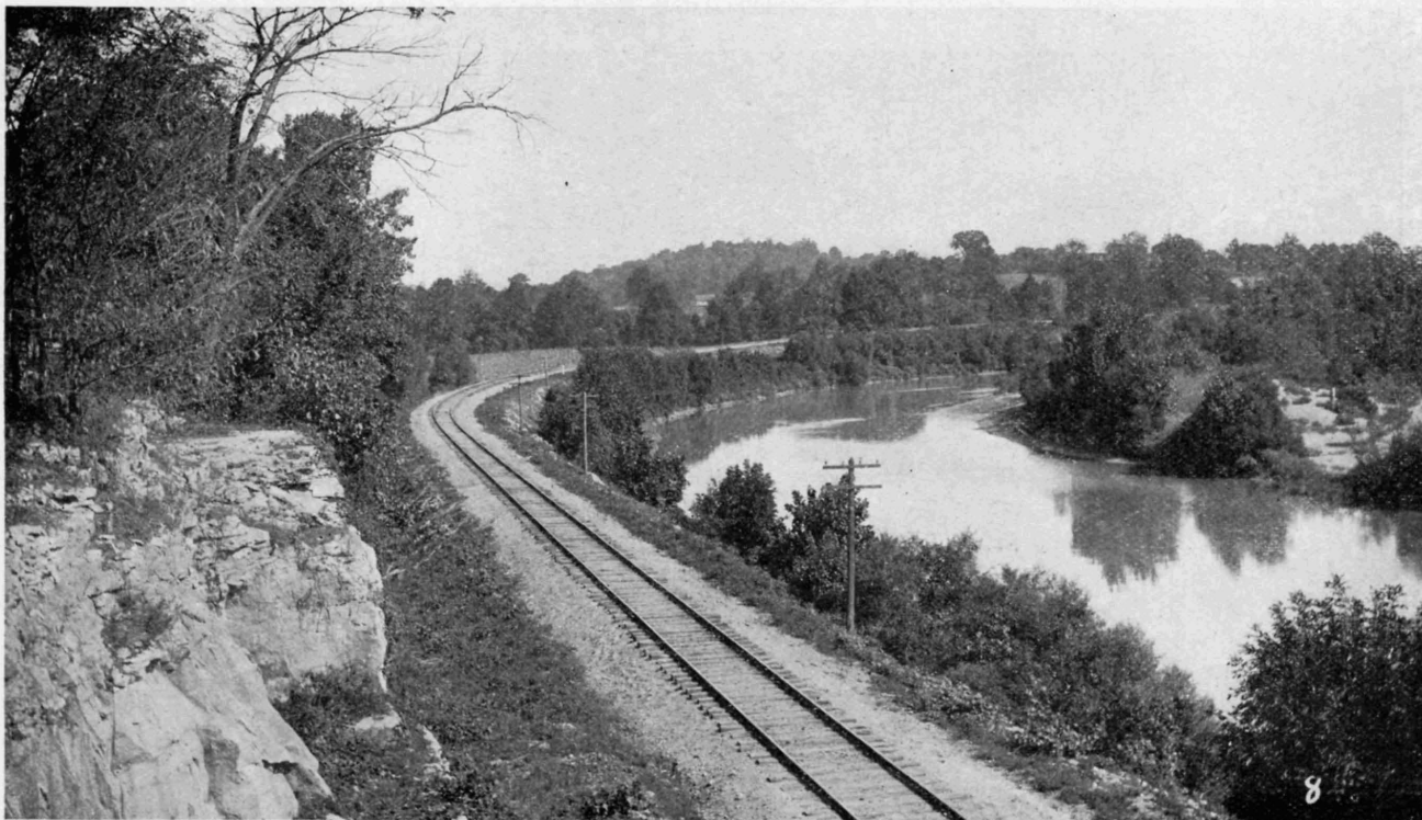
View on White River approaching canyon of "McCormick's Creek," near Spencer, Indiana.