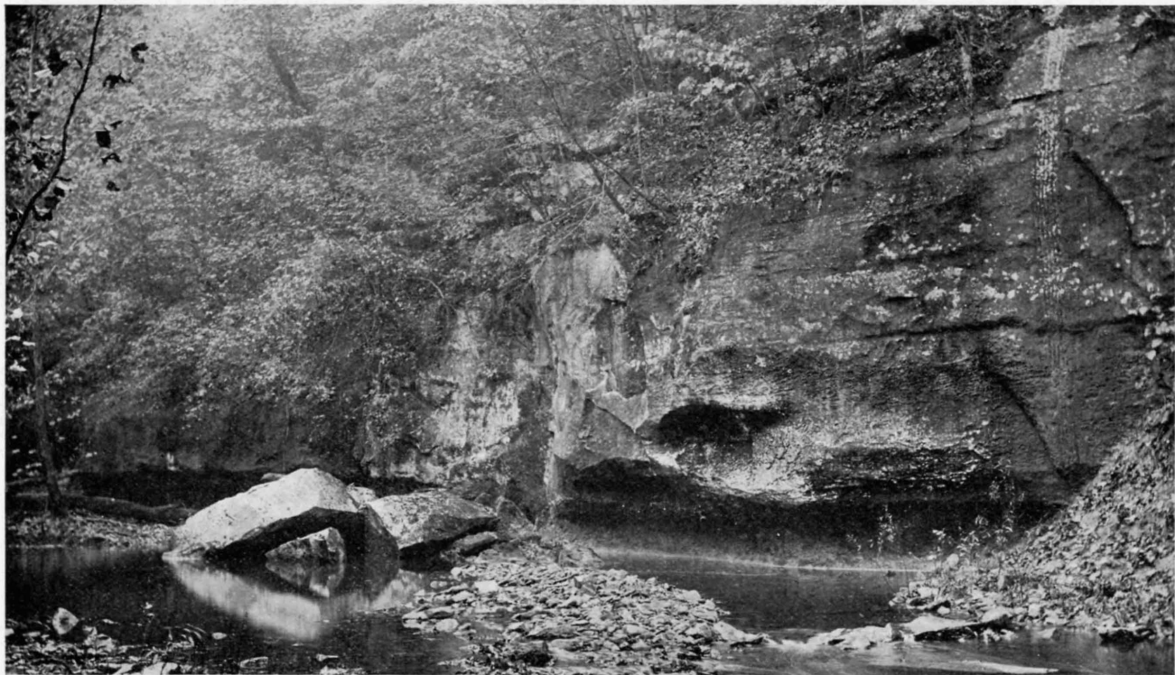
Massive lime stone wall near old quarry. "McCormick's Creek," canyon.