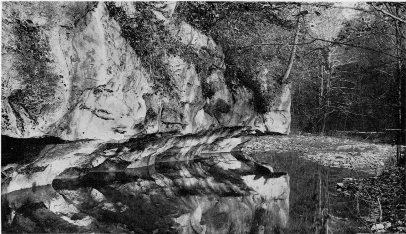
Wall of massive lime stone, showing undercutting of stream. Canyon "McCormick's Creek."