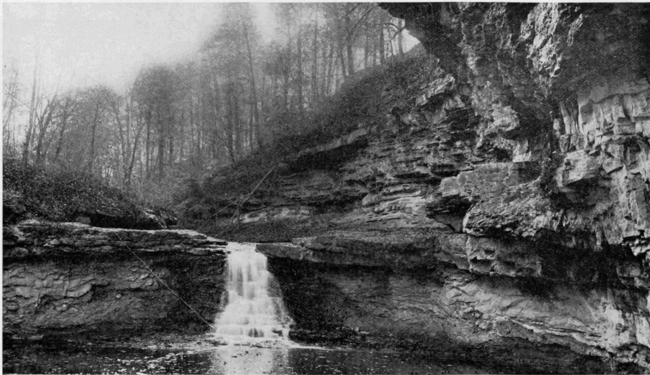
The cascade near head of canyon of "McCormick's Creek."