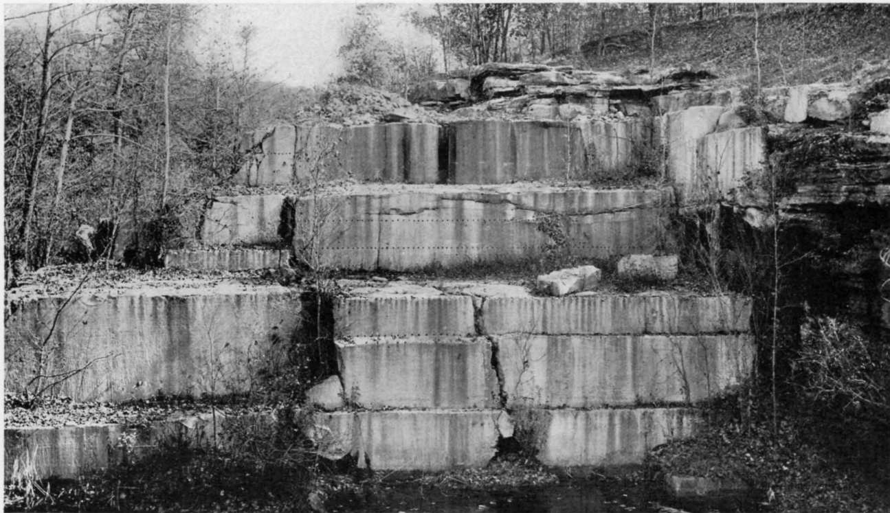
Old quarry of Bedford lime stone from which was taken stone for the construction of present State Capitol Building at Indianapolis. "McCormick's Creek" Canyon.