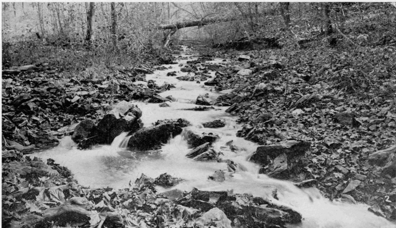
Head of "McCormicks' Creek" canyon, known as "Hell's Half Acre."