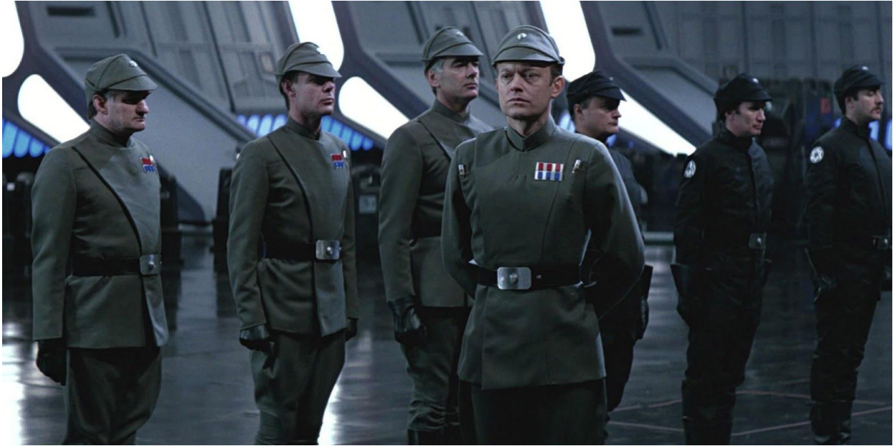
Imperial Army officers in Star Wars: Return of the Jedi. The waist belts, caps and breast insignia immediately conjure images of Nazi uniforms. The coat fasted with the waist belt is very similar to the SS Black Armoured Vehicle Tunic (Army-Style) pictured earlier in this paper. 56

When these elements are compared to images from the Third Reich, they are strikingly similar. While insignia and military awards are absent from the chests of the galactic villains, there is little missing when the images are juxtaposed. In a 1941 image of Rudolf Hess greeting German Armed Forces officers in Munich, the subordinate officers are neatly lined, facing the higher ranking Hess. Each officer is wearing an Army Officers' Piped Field Service Tunic, with clean, angled collars, sharply lined jackets, and black leather belts around the waist— down to the edges of these costumes, the resemblances are profound.