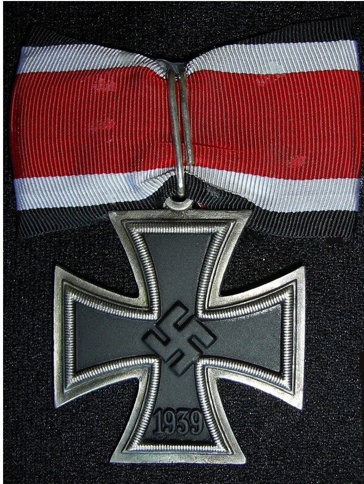
A Knight's Cross of the Iron Cross from September, 1st 1939. 44