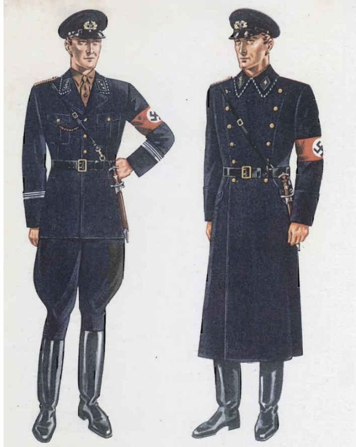
SS officer's uniforms. The stark effect of the pagented black SS uniform is apparent here as the colourway provides a background for showing off the various accoutrement and elegant details, such as gold buttons and belt buckles. 31

Uniforms perfectly served the purpose of the volksgemeinschaft and gleichschaltung . Goebbels, through his extensive and his ministry's groundbreaking propagandistic techniques, aimed, "to unite all creative persons in a cultural uniformity of the mind." 32 The effect this uniformity would have been perfect for an authoritarian regime: a people who support a government and its plans for the nation. As mentioned above, Germany was a nation of some 240 different uniforms for various jobs. The effect of this extensive uniformity would have been great: "Uniforms... emphasise the loss of individuality and dehumanise their wearers. When thousands are alike, no one individual seems to matter." 33 Therefore, the ability to dehumanise an