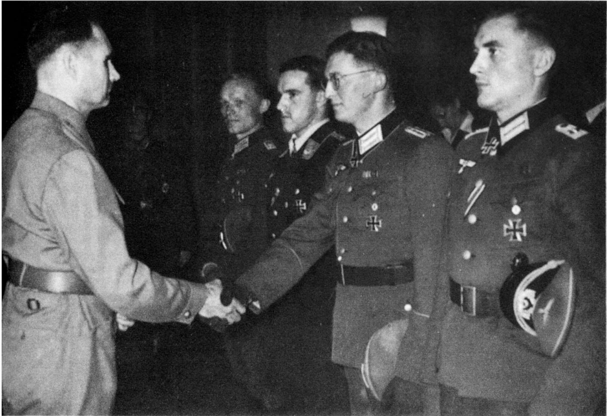
Rudolph Hess greets Officers of the German Armed Forces, 27 January, 1941. Waist belts, sharp collar lines and uniform lines are all similar to the above image from Star Wars. 57

These images, when placed side-by-side show just how pervasive Nazi fashion was, even through the 1980's film industry. The addition of an Iron Cross to the uniform of a Imperial soldier would make it so it would not be out of place in Germany under the Third Reich. The striking similarities between the villains of a Hollywood film, and the most dangerous villains in the history of the world show that the latter's propagandistic usage of fashion and the aesthetics of personal appearance came to be one of the most defining memories of their existence. The borrowing of Nazi aesthetic, decades after the fact, maintains Nazi fashion's place in history as a sign of power and unforgettable evil.