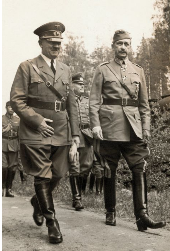
Photograph from Hitler's visit to Finland, 4 June 1942. Save hat and waist belt, the uniform worn by Charlie Chaplin is almost exactly like Hitler's. 53

The flamboyant uniform of Hynkel (Chaplin) bears an almost carbon-copy resemblance to those of the Nazi elite, specifically Hitler— even in black and white film. This was exactly Chaplin's intention so to be crystal clear as to who he was representing. The uniform of The Great Dictator is so simple, it could have been purchased at a clothing store the day of filming. There are no large military adornments, badges of rank, or even colour. However, by using each piece of the outfit together and by tailoring the clothing to fit the wearer, Chaplin's vêtements work in unison to create a recognisable symbol of a dictatorship, superiority and power.