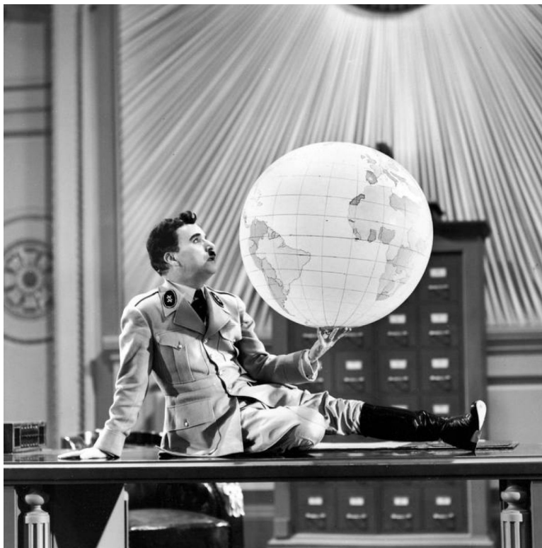
Charlie Chaplin as Adenoid Hynkel. The mock SS runes on the collar, the sharp lines, pockets, jodhpurs and boots are all nods to the uniforms of the Nazis and the image of Adolf Hitler. 52