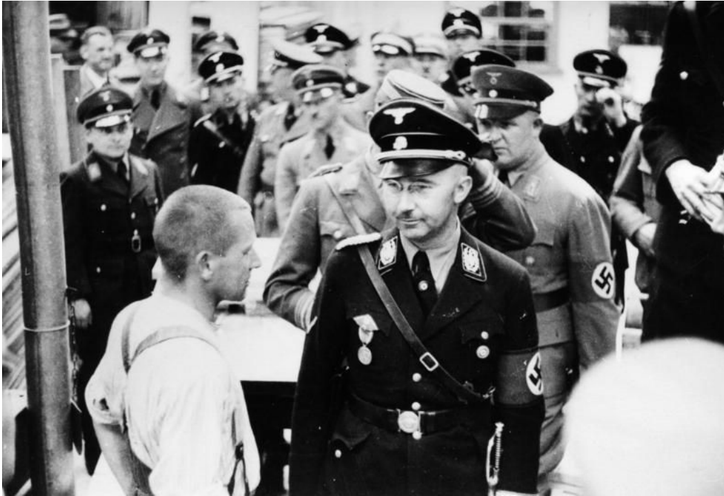
Heinrich Himmler wearing his black SS-Reichsführer uniform at Dachau concentration camp. Note: the wide lapels displaying SS rank insignia (also visible on the SS men behind him), the swastika arm band and a sabre handle at his left side. Additionally, this photograph shows the stark contrast of Himmler's black SS uniform against the pale complexion of the Dachau inmate's attire—another attempt to show the dominance of the Nazi party simply through clothing. 12

In upper ranks, the centerpiece of the SS uniform was a jacket that much more closely resembles a blazer or suit coat than a tunic. Instead of buttons extending to the collar, the jacket's fastening mechanism ended closer to the sternum. This was to display a brown or white collared shirt and black tie—dress that was formerly part of the Sturmabteilung (SA) uniform. 13 The jacket also featured large lapels which led up to large collars, which were used to distinguish divisions of the SS similar to those used by the Wehrmacht. Notably, the two SS siegrunes on the right collar worn by both the Waffen-SS and the Allgemeine-SS , the two largest divisions of the SS—the administrative and armed wings respectively. 14 The SS runes were a symbol of fear, simply