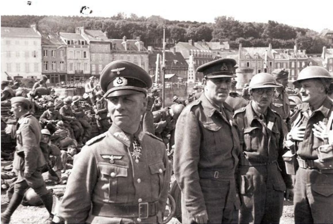
General Victor Fortune and General Major Erwin Rommel at St. Valéry after the surrender of Fortune's 51st Division to Rommel's 7th Panzer Division, 12 June 1940. 34

The stark contrast between the two men is so obvious, it is impossible to miss. Rommel stands proud and postured in his well-fitted jacket, his collar and belt pulled tight, his medals glistening and his hat perched atop his head firmly, as if to accentuate the rest of his uniform. Fortune stands disheveled; cuffs hanging mid-way down his hands, collar unbuttoned and clothing undecorated and blousey. It cannot go unnoticed that Rommel's regalia gives a pompous air of power. Fortune stands defeated—both in style and combat. However, this is most likely exacerbated by the fact that this meeting is planned. What this means is that Rommel has taken the vanity of his own uniform into consideration when meeting with his enemy. For Rommel and the rest of the German army, this was an opportunity for a double-victory. Fortune and his forces had already surrendered to the Germans, but if the Nazis could appear more powerful, through subtleties such as their manner of dress, they could install their own curated image into the eyes and minds of their onlookers. This effect could be far more pervasive for the Germans as it could