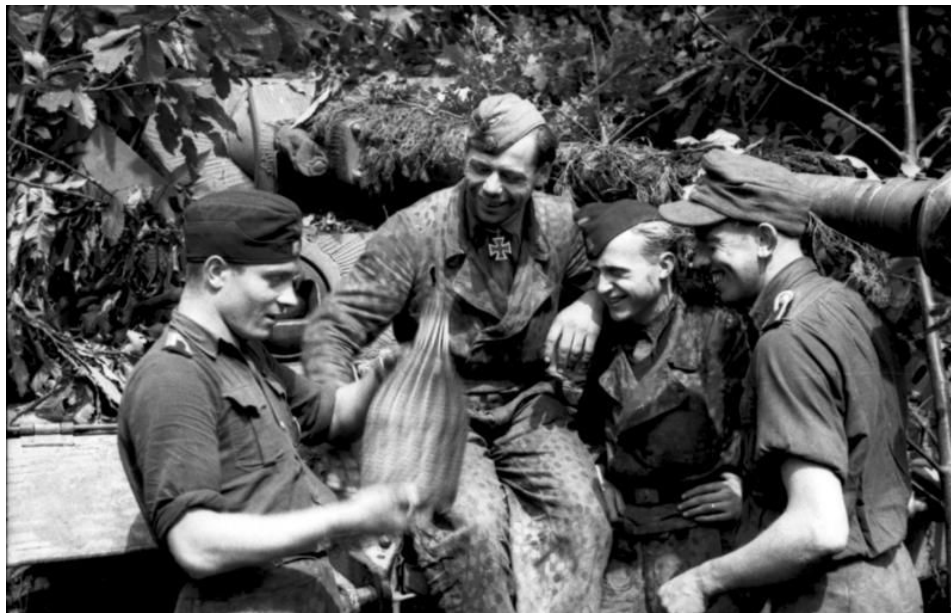
Waffen-SS of a soldiers laugh in front of a camouflaged panzer in France, 1944. The Iron Cross is again visible around the center man's neck— despite his wearing of camouflage. 46