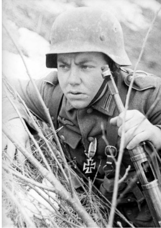
German soldier in brush combat conditions still proudly displaying his Iron Cross fastened to the button holes of his German Army Service Tunic. 45