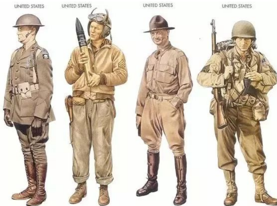
American World War II Uniforms. 36

“The Americans make neither a vindictive or arrogant impression. They are not soldiers in the Prussian sense at all. They do not wear uniforms, but overalls or overall-like combinations of high trousers and blouse all in gray-green; they do not carry a bayonet, only a short rifle or a long revolver ready at hand; the steel helmet is worn as comfortable a hat, pushed forward or back as it suits them.” 35