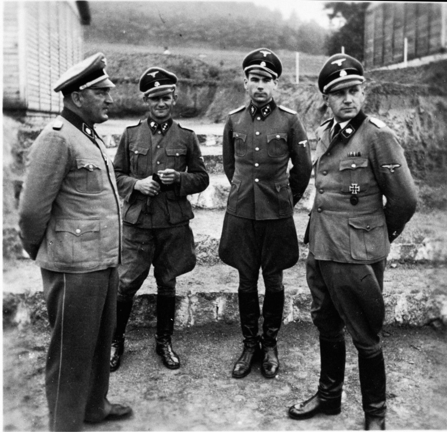
Members of the SS-Totenkopfverbände pose at Gross-Rosen concentration camp. Note: their polished riding boots. 40

Albin Greger, a German drafted into the SS, almost exactly copies Ziv's analysis of the refined SS outfit whilst describing his neighbor: "He was in the black uniform of the SS Totenkopfverbände (Death's Head Organisation), in shining black riding boots and with all kinds of silver on his collar. I was very impressed. He was still the same fellow, though, smiling placidly and saying little." 41 Here Greger almost perfectly reflects the language from Moshe Ziv. Not only was the SS Death's Head Unit uniform impressive, but each person, independent from each other and of different levels in society, notes the same impressive nature of the uniform itself. The impressions both include noting the silver accents and the uniform's shiny black boots. These two reflections compound the universal effect of the SS-Totenkopfverbände