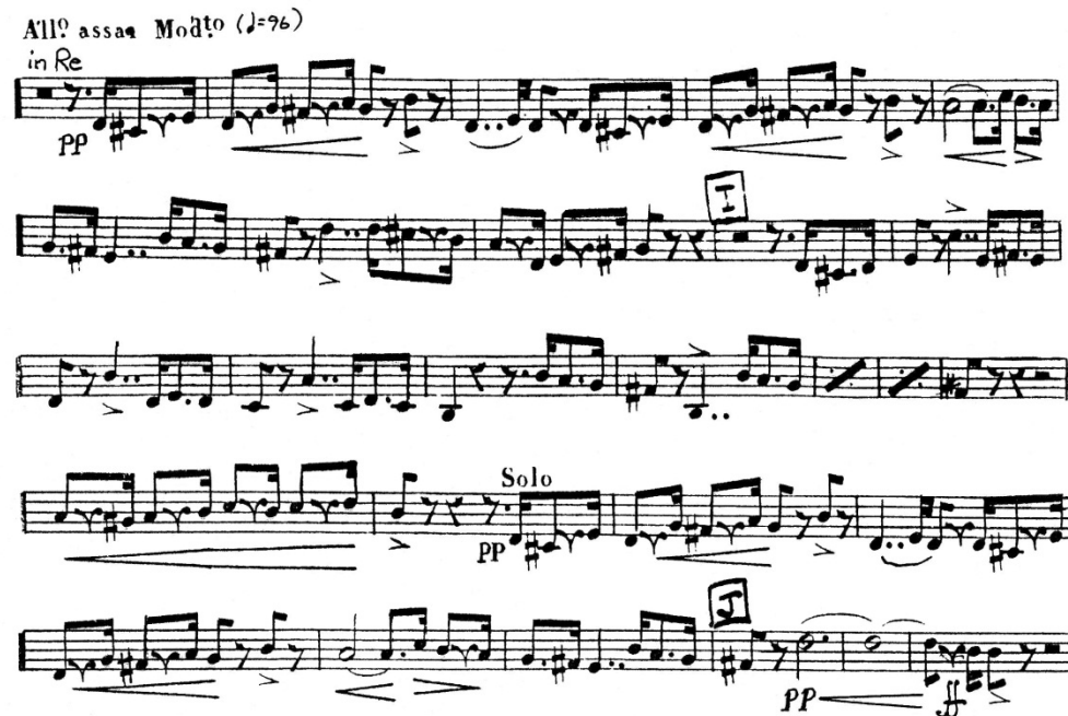
Excerpt 6.2: Verdi: Rigoletto – Act II, Scene 1: No. 8 – 16 before Reh. I to 18 after Reh. I (Trumpet 1)