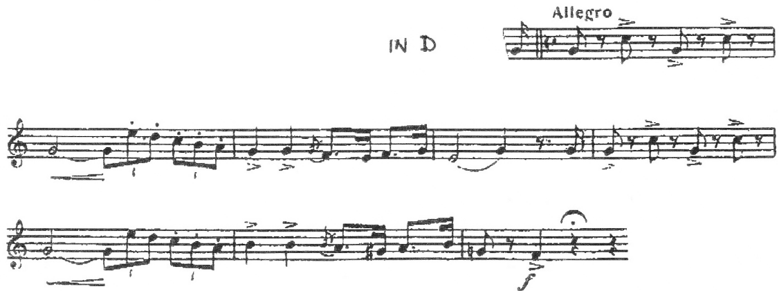
Excerpt 6.3: Verdi: Rigoletto – Act II, Scene 1: No. 8 – pickup to 40 mm. after Reh. 24 to 47 after Reh. 24 (Trumpet 1)