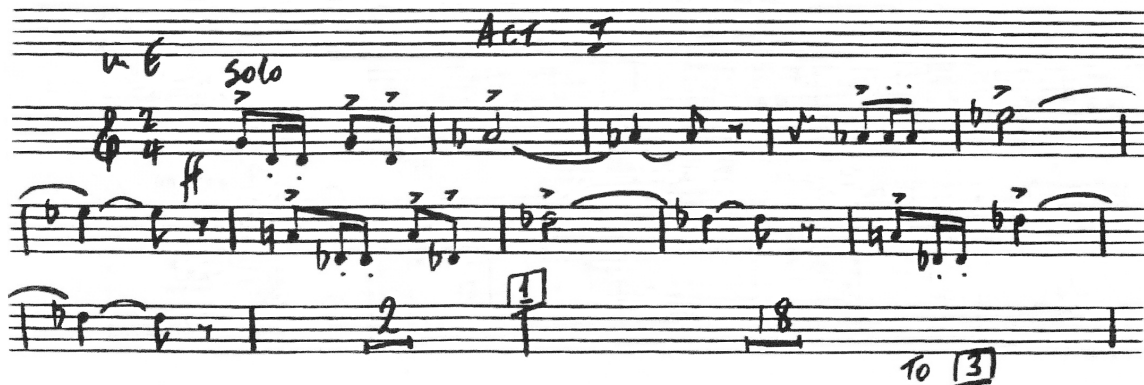
Excerpt 4.1: Leoncavallo: I Pagliacci – Act I: beginning to 2 before Reh. 1 (Onstage Trumpet)