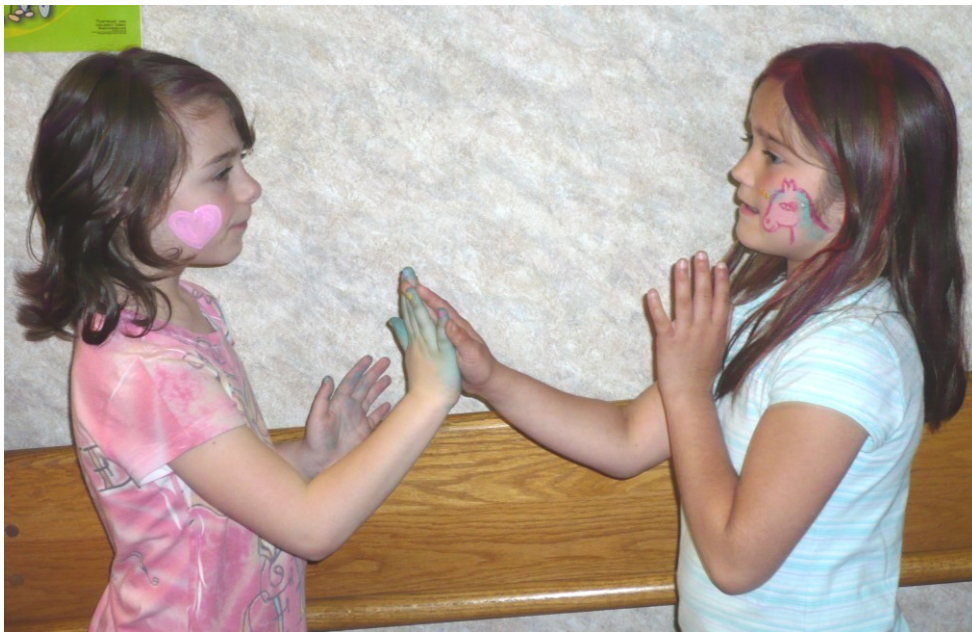
Nine-year-old girls playing handclapping games, Harrisburg, Pennsylvania, 2009

The course begins with the linear concept of the American life course as a form of folklore representing beliefs about age, fate, and afterlife that contrast with the constructions of age categories and their sequence in other cultures. The course then moves through different phases of life as they have been culturally organized in America: birth and childhood (games, jokes, rhymes, songs), adolescence and adulthood (initiations, rituals, family folklore, occupational folklore, midlife crisis), and old age/death (life review, funerary traditions, memorial traditions, humor about death). The course asks students to use folkloric materials as evidence of the distinctive ways that Americans navigate through the life course and work with others in groups and communities (involving issues of gender, ethnicity, race, and sexuality). Related to these issues, students are advised that because the course works from documents of people expressing themselves freely, material may contain strong language and images that some may consider offensive. The purpose of including this material is for open discussion of cultural reality, and not an endorsement of the language or beliefs expressed.